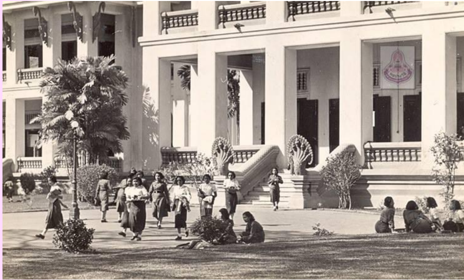
Faculty of Arts, Chulalongkorn University