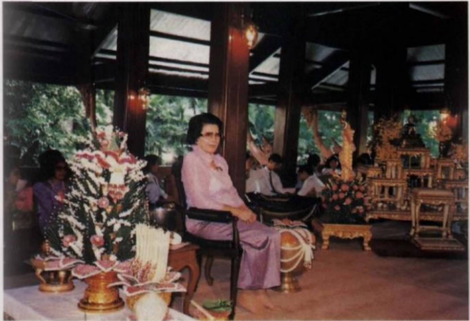
The first most venerable teacher of Chulalongkorn University’ and ‘Prominent Woman in Thailand.