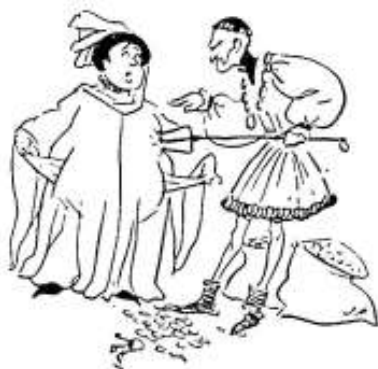
A certain distance