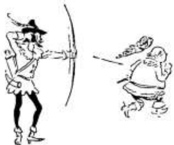
Sheriff running . . . . more difficult

Robin Hood was also very good at socialism and often took money away from rich clergymen and gave