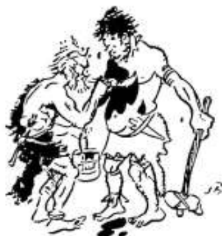
Dawn of British heroism

his cavalry several thousands of paces over the River Flumen; but the Ancient Britons, though all well over military age, painted themselves true blue, or woad , and fought as heroically under their dashing