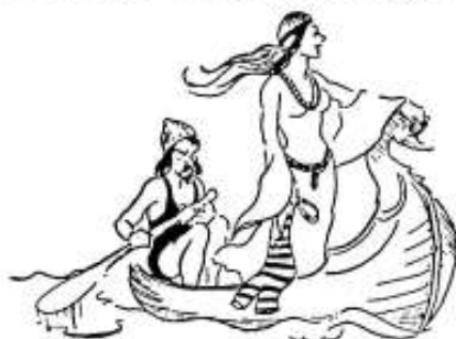
A Bad Queen

King Arthur's time that the Anglo-Saxon Chronicle was published: this was the first English newspaper