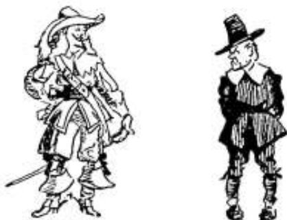
Under these circumstances.

flowing hat and gay attire . The Roundheads, on the other hand, were clean-shaven and wore tall, conical hats, white ties and sombre garments . Under these circumstances a Civil War was inevitable.