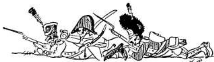
To march on their Stomachs

all the way to Moscow on their stomachs they got frozen to death one by one, and even Napoleon himself admitted afterwards that it was rather a Bad Thing.