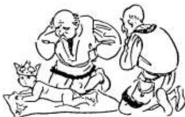
A weak king

T HE next King, Henry VI, was only one year old and was thus rather a Weak King; indeed the Barons declared that he was quite numb