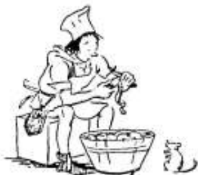
Punishment of Lannel (or Wermkin).

Perkin Warbeck (the Older and more confusing Pretender) insisted that he was himself, thus causing complete dissension till Henry VII had him led through the streets of London to prove that he was really Lambert Simnel.