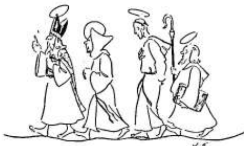
Wave of Sts.

The conversion of England was thus effected by the landing of St. Augustine in Thanet and other places, which resulted in the country being overrun by a Wave of Saints. Among these were St. Ive, St. Pancra,