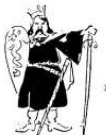
A Bad King

Canute began by being a Bad King on the advice of his Courtiers, who informed him (owing to a misunderstanding of the Rule Britannia) that the King