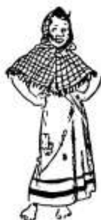
Mr. Arkwright's Invention

The Industrial Revelation would never have occurred but for the wave of great mechanical Inventors, e.g. Arkwright, who invented the Spinning Jenny, or