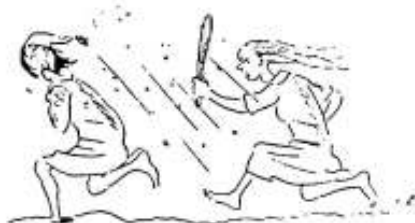
Lax State of Affairs

After this Stephen and Matilda (or Maud) spent the reign escaping from each other over the snow in night-gowns while 'God and His Angels slept.'