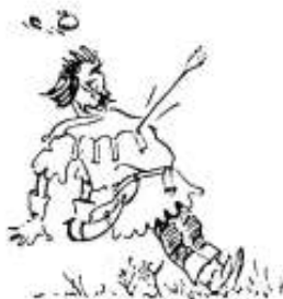
A Good Thing

T HIS monarch was always very angry and red in the face and was therefore unpopular, so that his death was a Good Thing: it occurred in the following memorable way. Rufus was hunting one day in the New Forest, when William Tell (the memorable crackshot, inventor of Cross-bow puzzles)