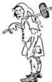
To extract from The Villein .