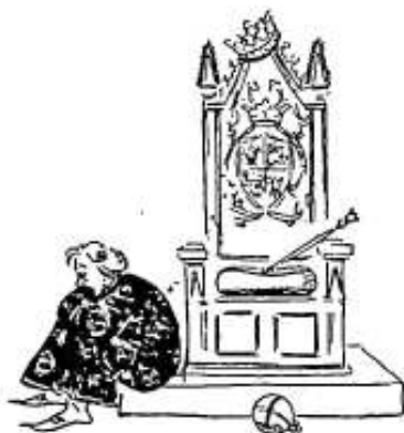
Got off the throne

R ICHARD II was only a boy at his accession : one day, however, suspecting that he was now twenty-one, he asked his uncle and, on learning that he was, mounted the throne himself