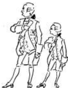
Wave of Pitts

The elder Pitt (Clapham) at this time had the rather strategic idea of conquering Canada on the banks of the Elbe ; learning, however, that it was not there he told the famous poetic general, Wolfe, to conquer