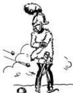
Suffered terribly from their Cardigans and Balaclava helmets

boots on their left feet until the memorable intervention of Flora MacNightlight (the Lady with the Deadly Lampshade), who gave them boots for their right feet and other comforts, and cured them of their sufferings every night with doses of deadly lampshade.