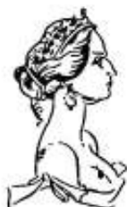
Good . . . but not amused

Finding herself on the throne, Queen Victoria immediately announced her intention of being Good and plural but not amused . This challenge was joyfully