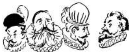
Wave of Beards

One of the most romantic aspects of the Elizabethan age was the wave of beards which suddenly swept