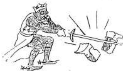
A Wild King

R ICHARD I was a hairy King with a Lion's Heart; he went roaring about the Desert making ferocious attacks on the Saladins and the Paladins, and was thus, a very romantic King. Whenever he returned to England he always set out again immediately for the Mediterranean and was therefore known as Richard Gare de Lyon. He had a