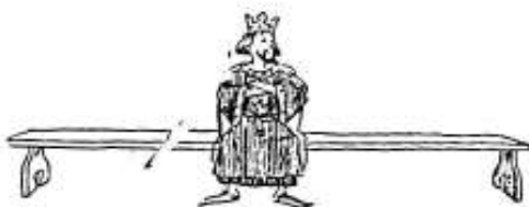
Sat on it himself

Edward I was thus a strong King, and one of the first things he did was to make a strong arrangement about the Law Courts. Hitherto there had been a number of Benches there, on all of which a confused