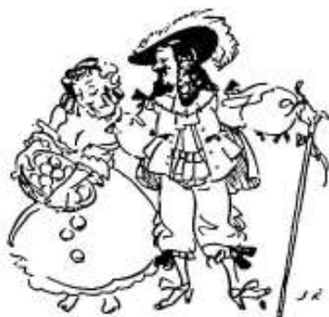
A Bad Man

C HARLES II was always very merry and was therefore not so much a king as a Monarch. During the civil war he had rendered valuable assistance to his father's side by hiding in all the oak-