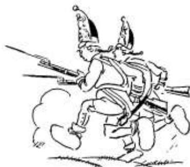
Britain muffles through

his own men who were flying. "Thank God!" said Keep-calm, with a sigh of satisfaction: "Now, I can fly in peace!"