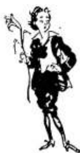
Wrote very well but . . .

There was also in Queen Victoria's reign a famous inventor and poet called Oscar Wilde who wrote very