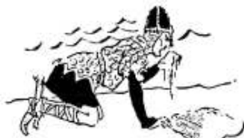
First Conquering Action

When William the Conqueror landed he lay down on the beach and swallowed two mouthfuls of sand.