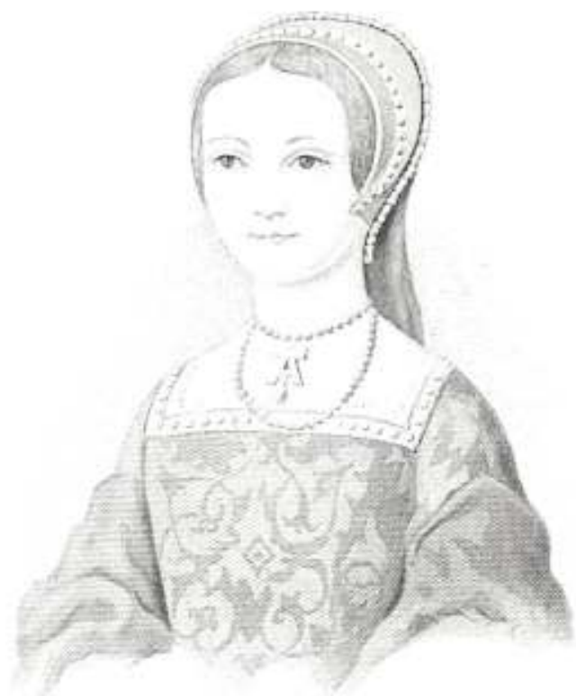
Mary I st as Queen