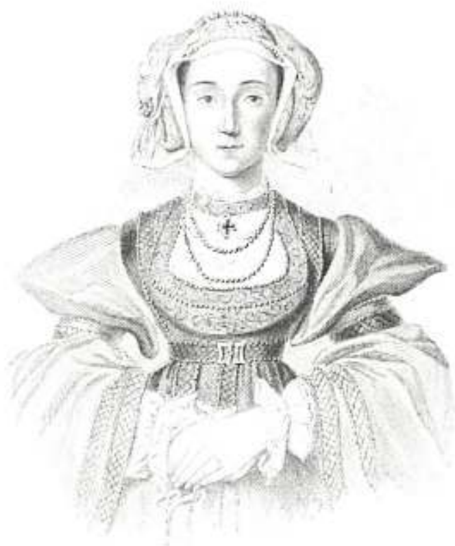
Anne of Cleves