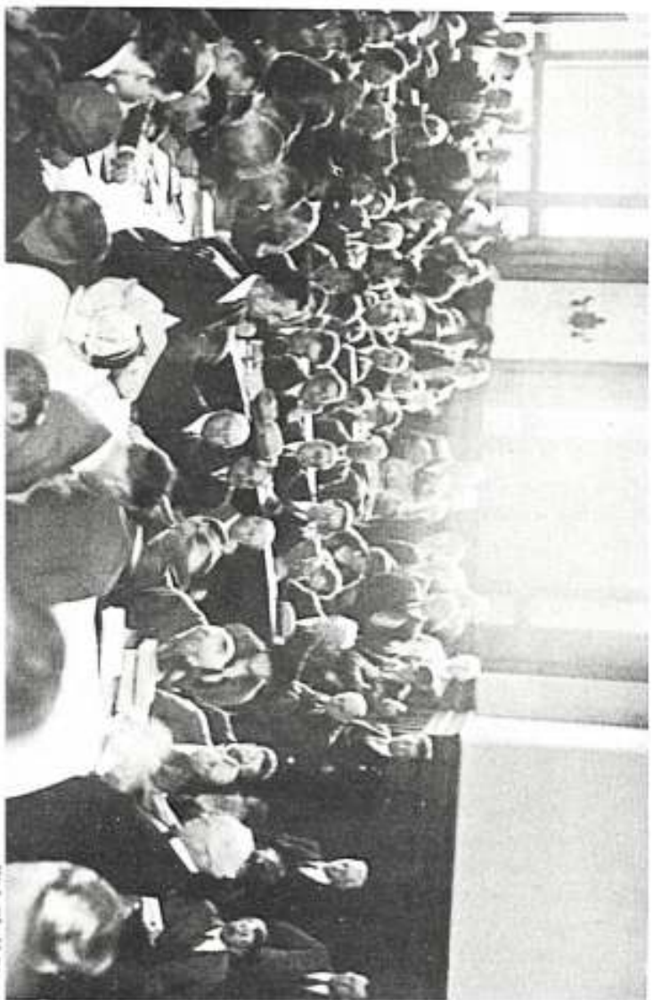
THE PIC-WOMAN TESTIFIES from a hospital bed in the Hall-Mills Trial of 1926