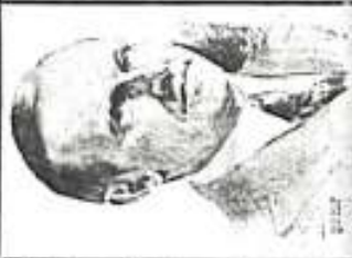
CALVIN COOLIDGE, PRESIDENT OF THE UNITED STATES, TODAY TOOK THE OATH OF OFFICE IN HIS LIBRARY. HIS FATHER, WHO IS A NOTARY PUBLIC, ADMINISTERED IT AFTER THE TERM WAS READ BY HIM.

WASHINGTON, August 5, 1923.—The President of the United States, Calvin Coolidge, today issued the following statement: "I have just received the news of the death of President Woodrow Wilson, and I am deeply grieved by the loss of this great statesman. I have known Mr. Wilson since he was a young man, and I have always admired his character and his ability. He was a man of great courage and of great integrity, and he was a man who was always ready to stand for the principles of justice and of freedom. I have always been proud to have known him, and I am sure that his memory will be a source of inspiration to all of us who are his countrymen. I am sure that his death will be a great loss to our country, and I am sure that his memory will be a source of inspiration to all of us who are his countrymen. I am sure that his death will be a great loss to our country, and I am sure that his memory will be a source of inspiration to all of us who are his countrymen."