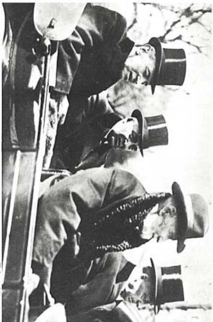
WILSON AND HANDING RIDE TO THE CAPITOL for the latter's inauguration, March 4, 1921. In the front seat are Speaker Joseph G. Cannon and Senator Philander C. Knox