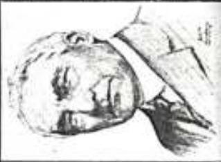
WOODROW WILSON, PRESIDENT OF THE UNITED STATES, DIED AT 7:30 P. M. TODAY. HE HAD BEEN ILL FOR SEVERAL DAYS.

HEAVY SURGE CAME WITHOUT WARNING Mrs. Harding Was Reading to Her Husband When First Signs Appeared —She Ran for Doctor