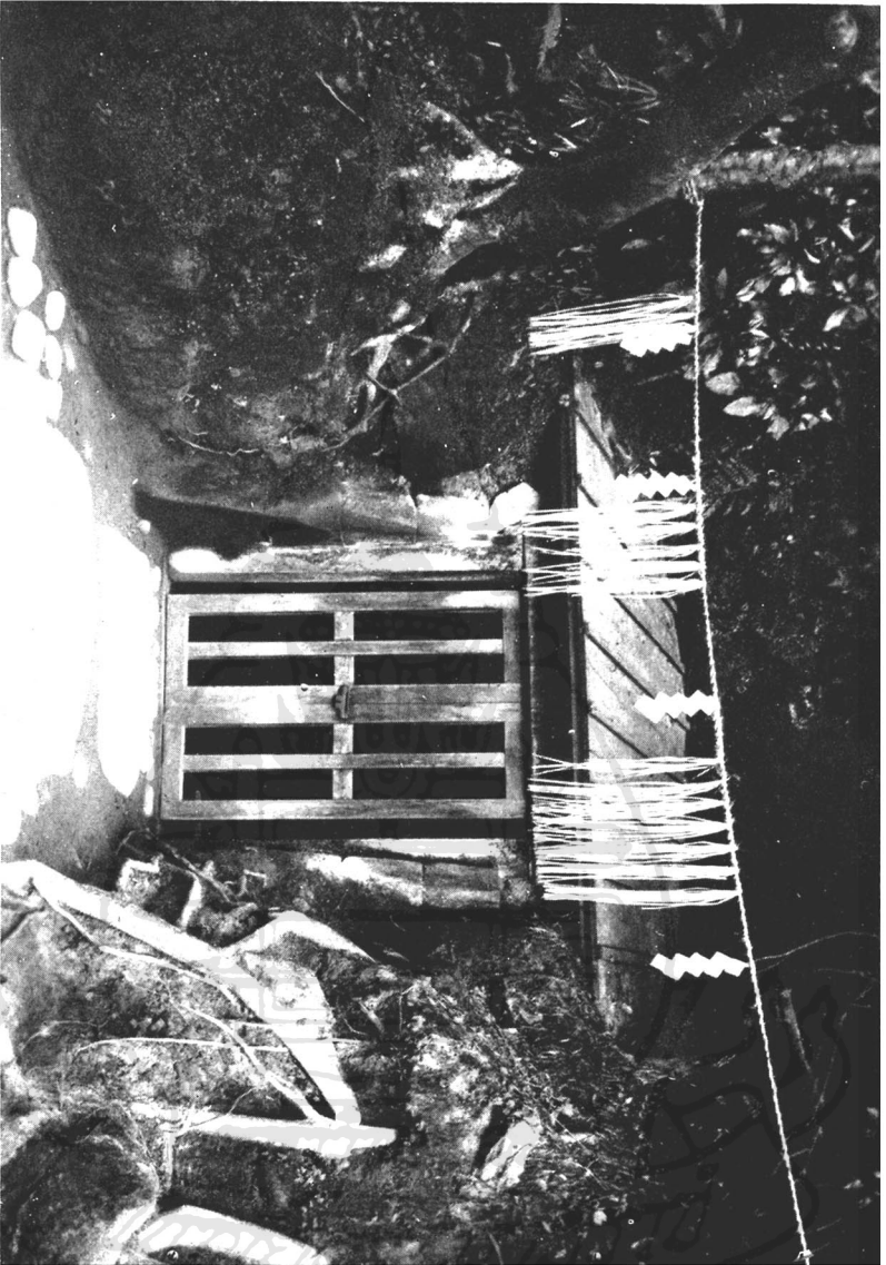
The dark Cavern wherein the unfortunate Prince Morinaga was imprisoned for seven months before his assassination in 1335.