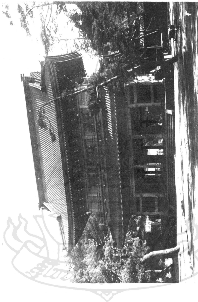
Tower-Gate of Kōmyōji.