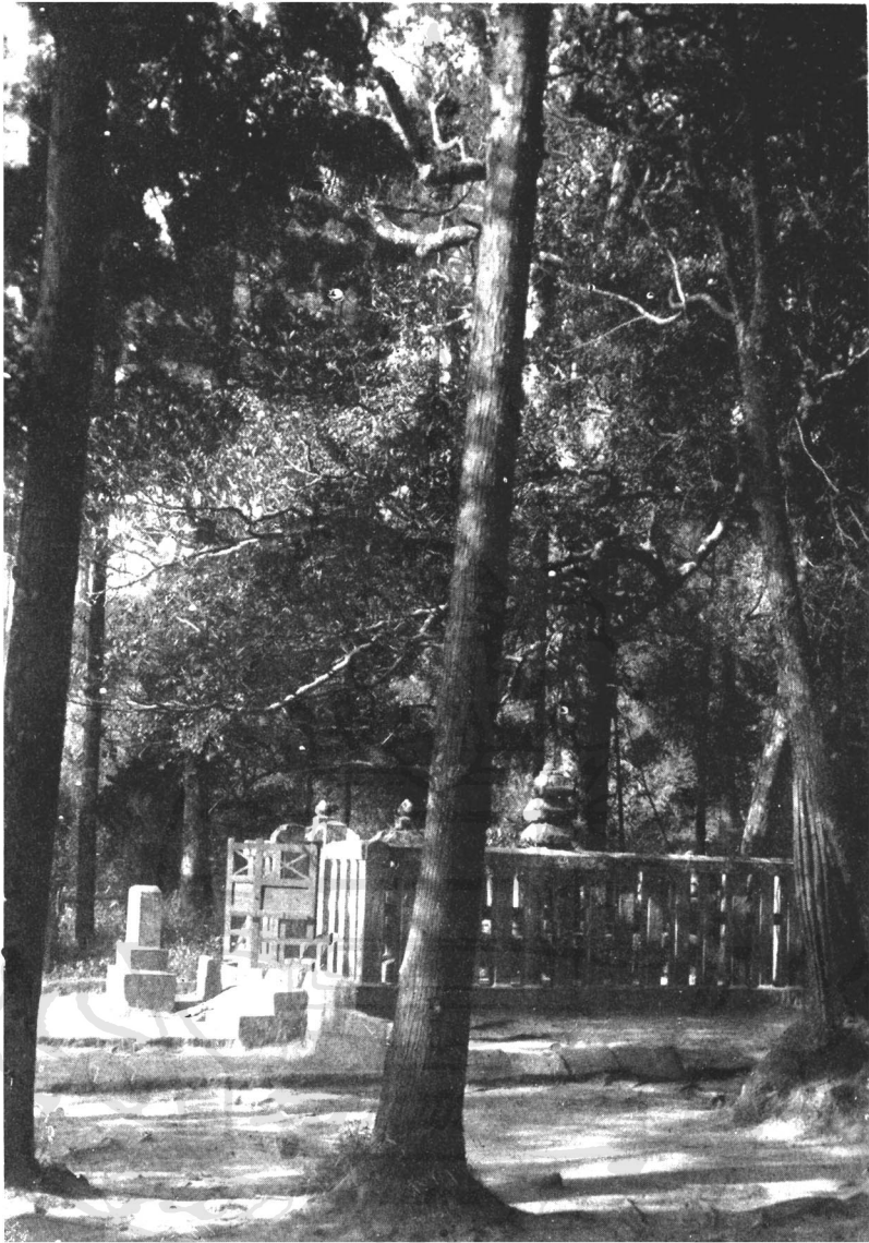
Tomb of Yoritomo.