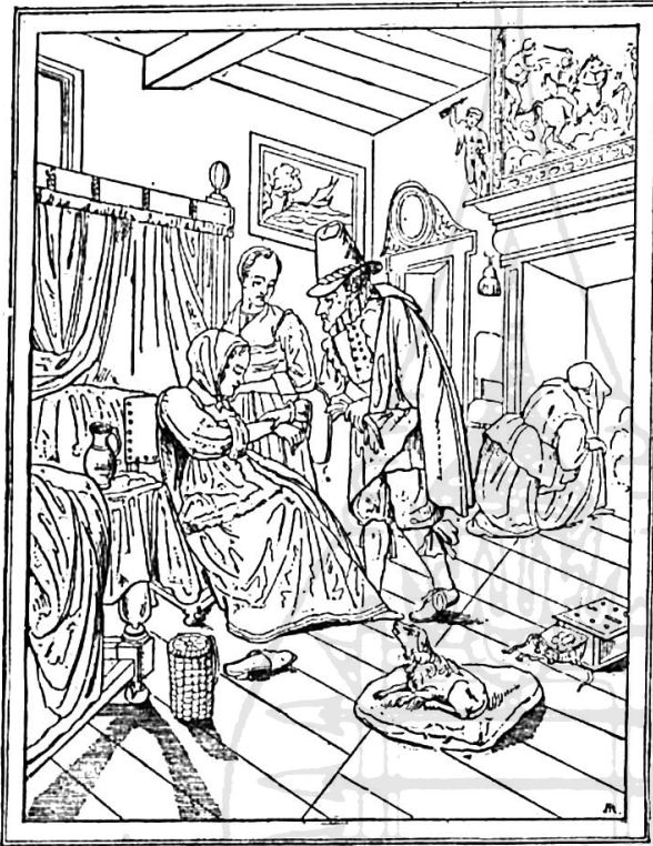
A PATIENT AND DOCTOR — SEVENTEENTH CENTURY INTERIOR (After the painting by Jan Steen, 1626-1679)

He encountered the French fleet under the admiral Duquesne, between the islands of Stromboli and Salina, but without any decisive result. Having effected a junction with ten Spanish vessels, he came to a second engagement on the coast of Sicily, with Duquesne, who had likewise received a reinforcement of twelve men-of-war and four frigates. Almost at the commencement of the battle, De Ruyter was struck by a cannon ball,