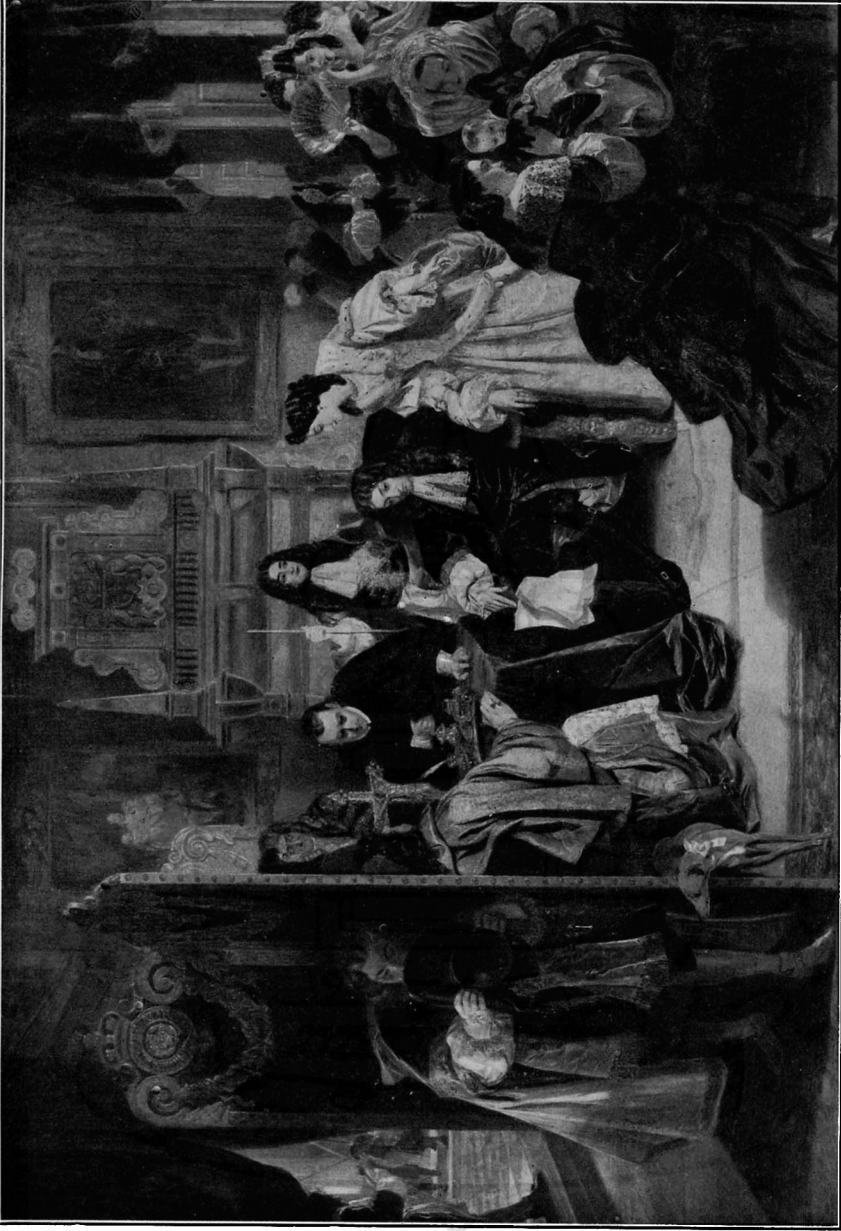
JAMES II RECEIVING THE NEWS OF THE LANDING OF THE PRINCE OF ORANGE

(From the painting by Edward M. Ward, in the National Gallery)