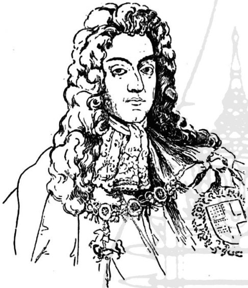
WILLIAM III (1650-1701)

Considered as a politician, his capacity for government appeared in a very different light in his native country, where he was surrounded by able and zealous ministers, and in England, where he was left to depend more upon his own resources. In Holland he had merely to express his opinions,