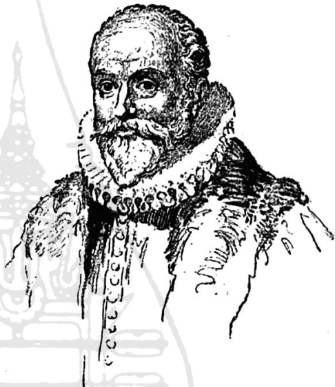
JAKOBUS ARMINIUS (1560-1609)

Next the Arminian and Gomarist religious war broke out; and Barneveld, fearing a renewal of the church disturbances of Leicester's time, felt that only vigorous action by the states-general could avert serious trouble. He declared it to be better to be ruled by a lord than by a mob, though he equally abhorred hierarchy, monarchy, and democracy. He cared little about creeds, but he cared much about peace. The states forbade the Gomarist or counter-