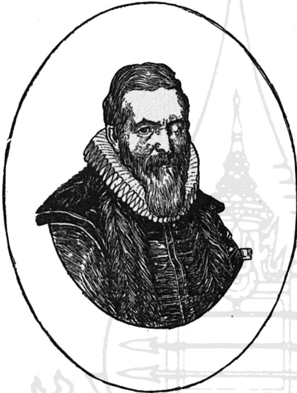
JAN VAN OLDEN-BARNEVELD (1549-1691)