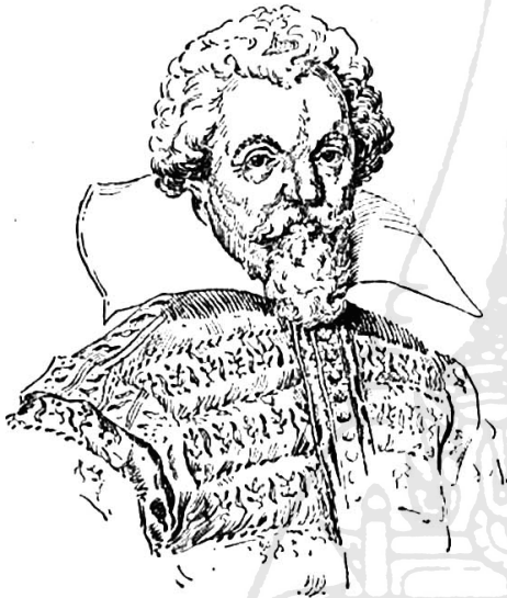
PHILIPPE DUPLESSIS-MORNAY (1540-1623)

The intense religious disputes brought this duel between two ambitious politicians to that fanatic length whither religious disputes usually tend. The states-general, under Barneveld's strong control, had at first sought to allay the fever of the Gomarists or Calvinists, but had only infuriated them by this "interference" of the state in the solemn doctrines of the church. Barneveld thus became an object of hatred to the other states of the union and to the majority of religious enthusiasts. But Maurice gradually inclined to the Calvinist side, and found himself heading the mass of the public in the resistance to Barneveld. Maurice was distinctly the leader of the populace.