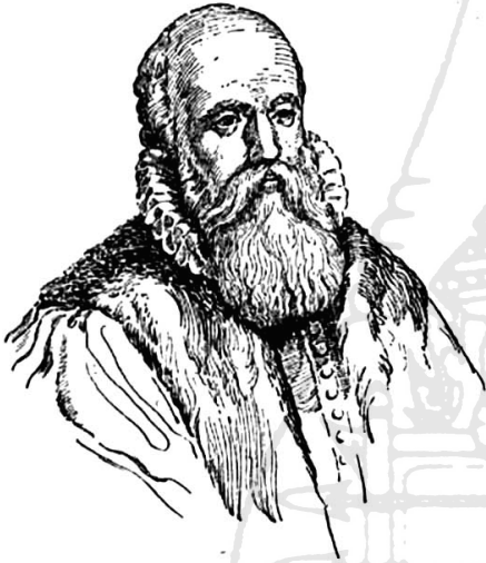
FRANCIS GOMARUS (1593-1641)

But the main question of agitation was the fierce dispute which soon broke out between two professors of theology of the university of Leyden, Francis Gomarus and Jakobus Arminius [Jacob van Harmensen]. We do not regret on this occasion that our confined limits spare us the task of recording in detail controversies on points of speculative doctrine. The whole