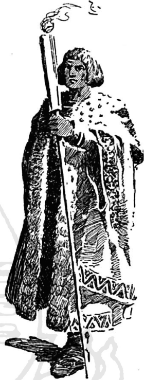
TORCHBEARER OF THE SIXTEENTH CENTURY

The accession of a powerful and ambitious prince to the government of the county was anything but a source of advantage to the Dutch, excepting, perhaps, in a commercial point of view. Its effects were soon perceived in the declaration made by the council of Holland that the charters and privileges, acknowledged by the duke as governor and heir, were of no effect, unless afterwards confirmed by him as count. Nor was the diminution of their civil liberties the only evil which foreign dominion brought upon them. The last nation in Europe with which Holland would voluntarily wage war was perhaps England, and yet it was against her that she was now called upon to lavish her blood and treasure in an unprofitable contest.