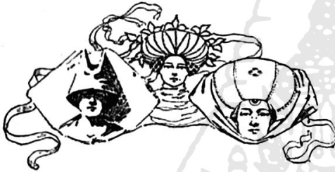
HEAD-DRESSES OF THE SIXTEENTH CENTURY

This Philip of Burgundy was deeply affected by the doctrines of the Reformation, which had burst forth in Germany. He held in abhorrence the observances of the Roman church, and set his face against the celibacy