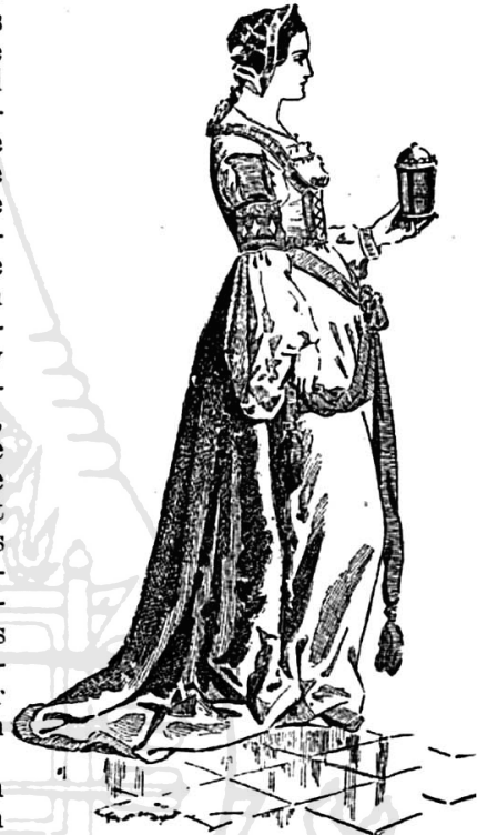
COURT ATTENDANT OF THE SIXTEENTH CENTURY