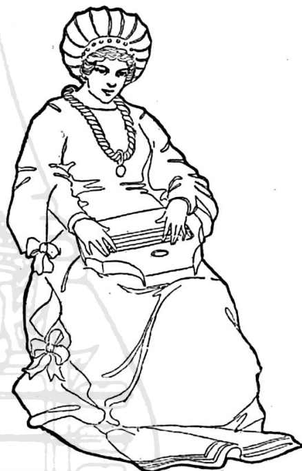
NOBLEWOMAN OF THE SIXTEENTH CENTURY

The wealth procured by the genius and industry of the Netherlanders enabled them to sustain the heavy burdens laid upon them by Duke Philip with a comparative ease which led Comines, g a contemporary author, to suppose that they were, in fact, more lightly taxed than the subjects of other princes. As Philip, however, during the whole of his reign kept up a court which surpassed every other in Europe in luxury and magnificence, and contrived besides to amass vast sums of money, it is evident that his treasury must have been liberally supplied by his people. During his attendance on Louis XI, at Paris, when that monarch went to take possession of his kingdom, Monstrelet h says "he excited the admiration of the Parisians by the splendour of his dress, table, and equipages; the hôtel d'Artois, where he lived, was hung with the richest tapestries ever seen in France. When he rode through the streets, he wore every day some new dress, or jewel of price — the frontlet of his horse was covered with the richest jewels."