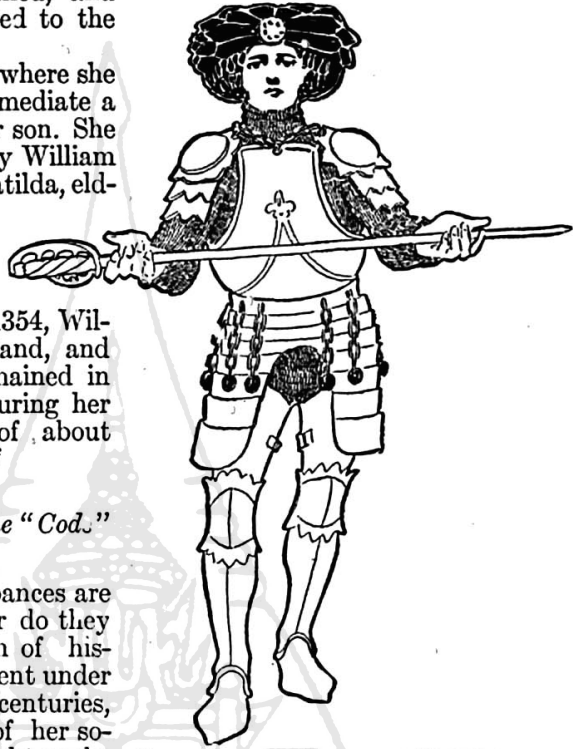
SOLDIER OF THE FIFTEENTH CENTURY

Margaret fled to England, where she prevailed upon the king to mediate a peace between herself and her son. She was shortly after followed by William himself, who married there Matilda, eldest daughter of Henry, duke of Lancaster. William likewise accepted the mediation of Edward. According to the terms of the agreement of 1354, William retained Holland, Zealand, and Friesland, while Hainault remained in the possession of Margaret during her life, with a yearly income of about twenty-four hundred pounds.