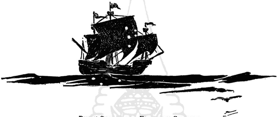
DUTCH SHIP OF THE FIFTEENTH CENTURY