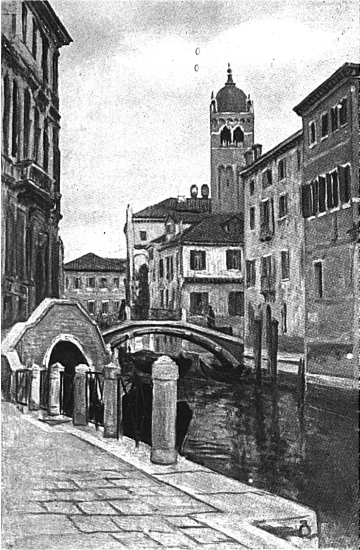
S. FOSCA AND PALAZZO GIOVANELLI.