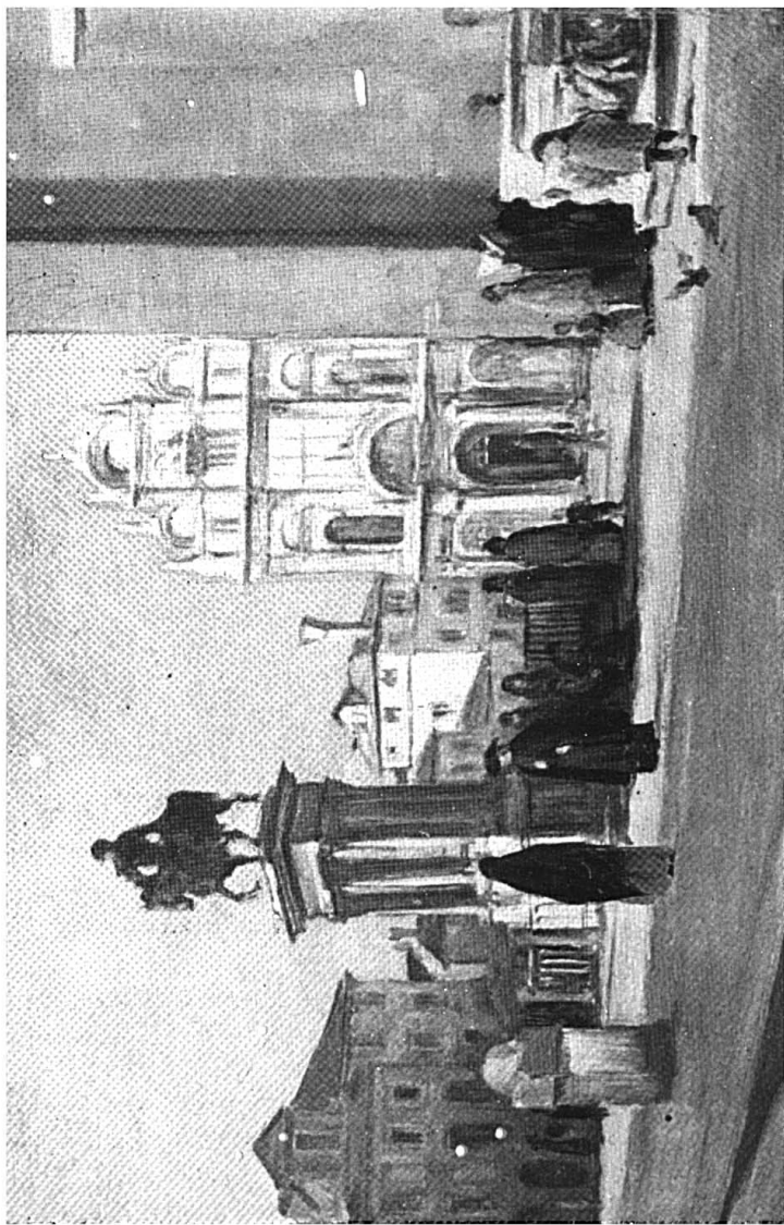
SCUOLA DI SAN MARCO AND STATUE OF COLLEONI.