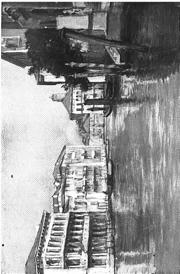
GRAND CANAL.—PALAZZI REZZONICO AND FOSCARI.