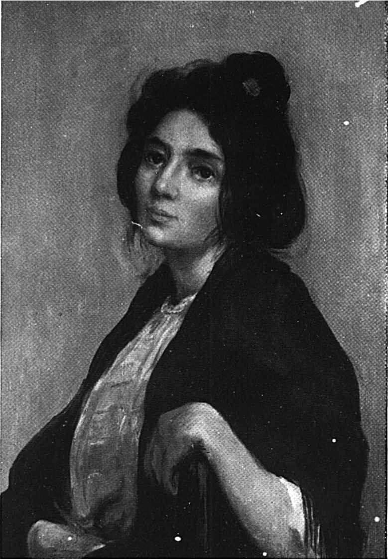
A VENETIAN WOMAN.