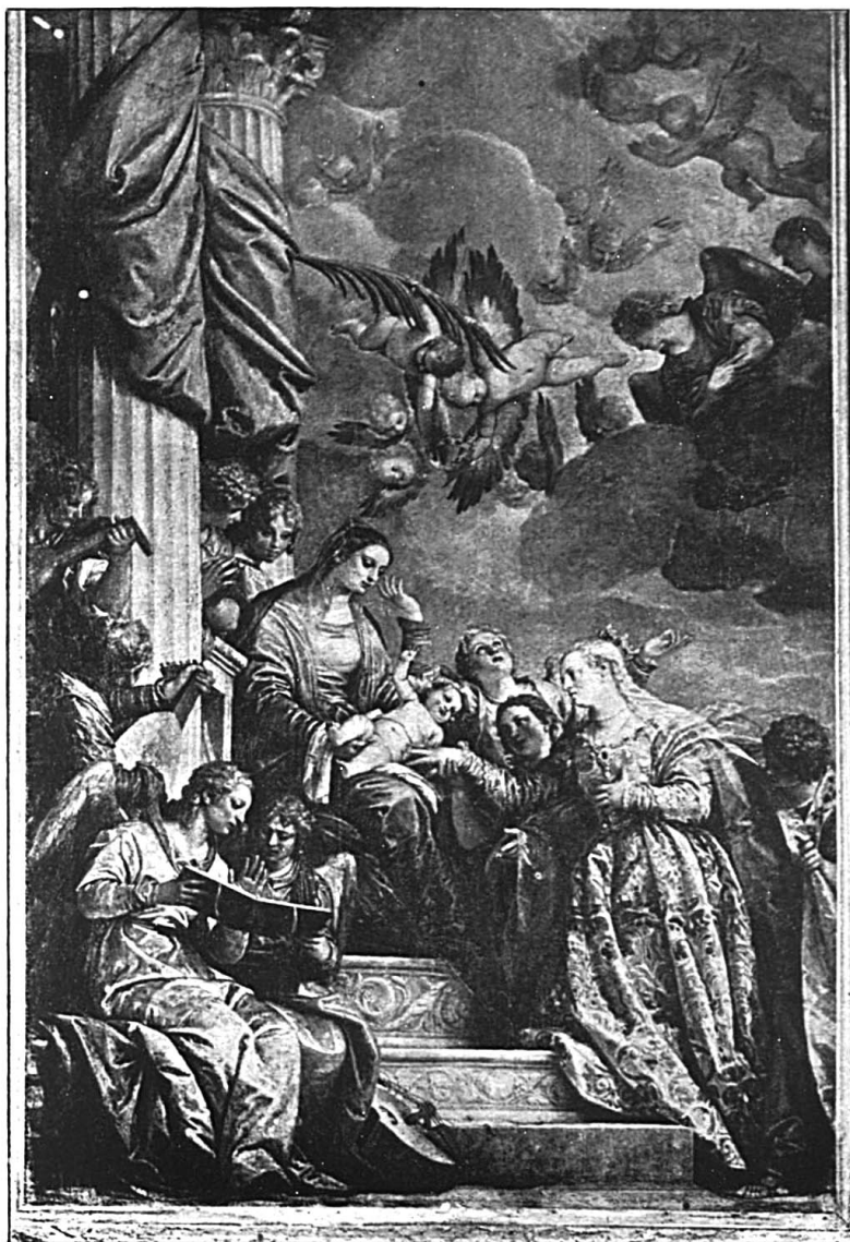
S. CATERINA—THE MARRIAGE OF ST CATHERINE