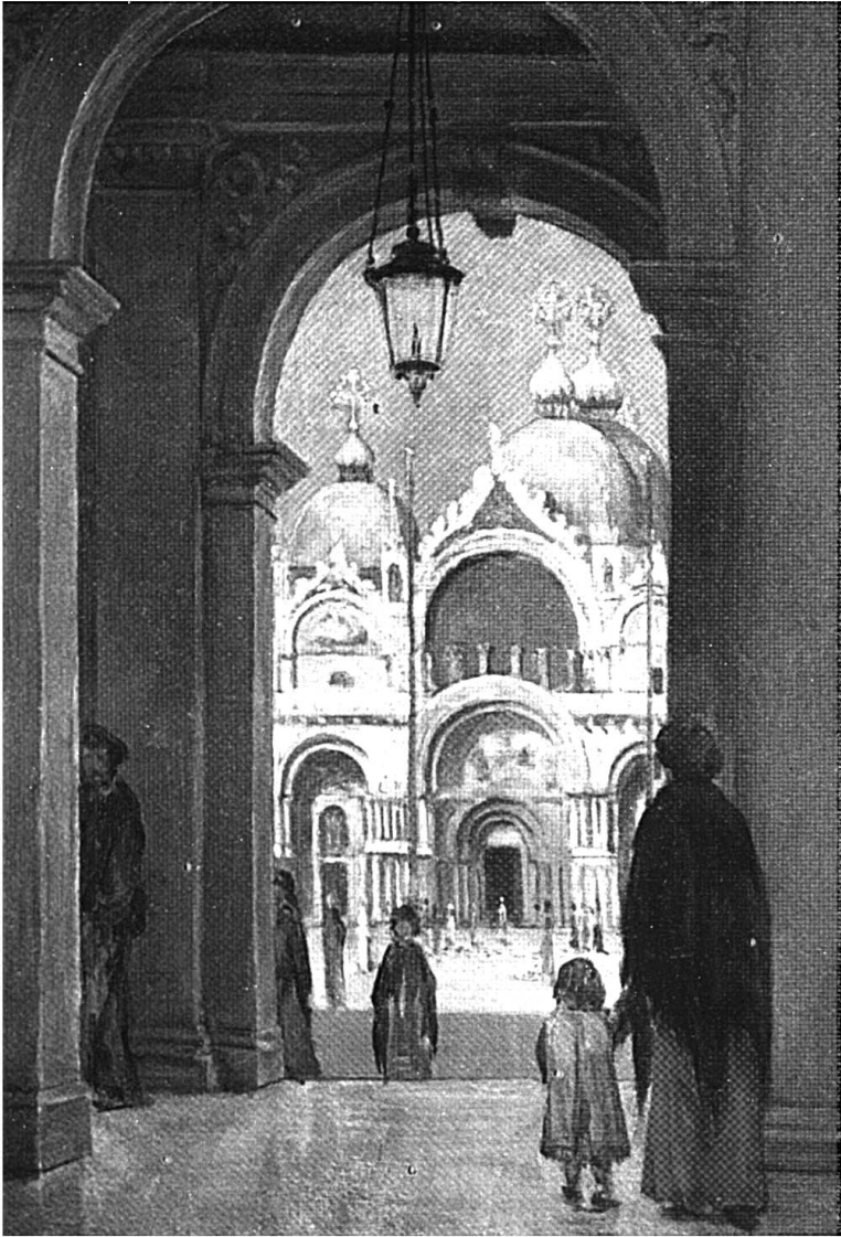
IN THE PROCURATIE NUOVE.