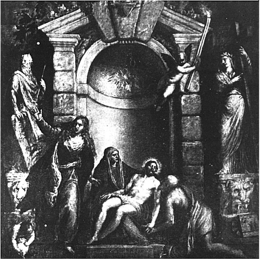
ACCADEMIA—THE DEAD CHRIST