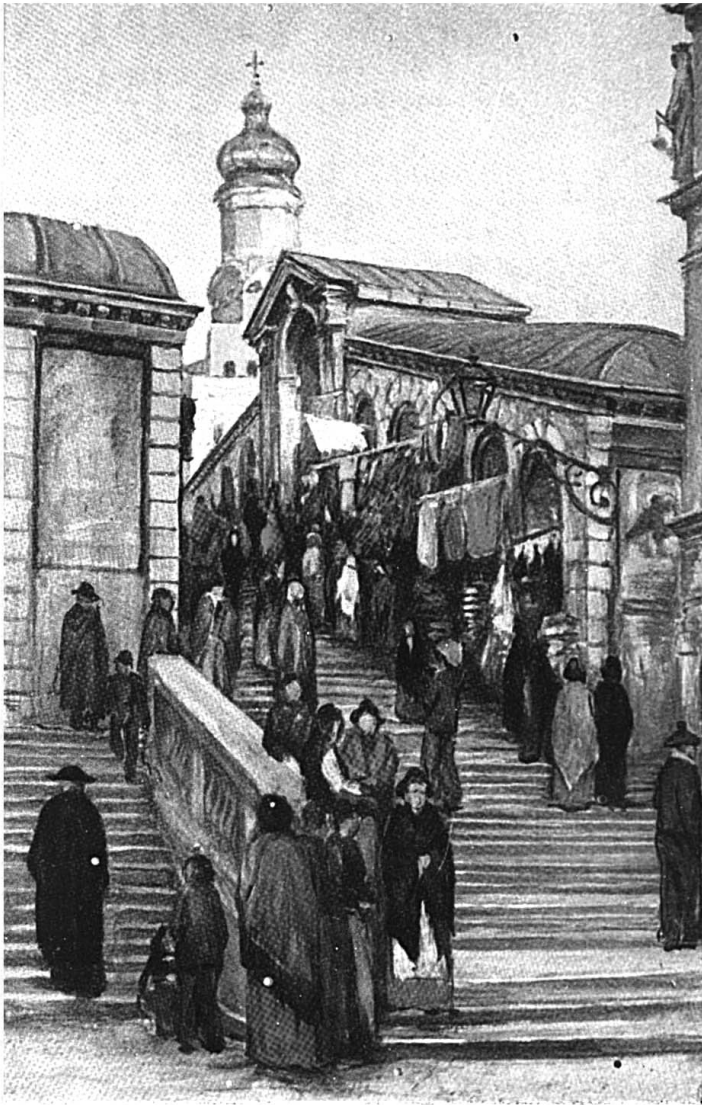
PONTE DI RIALTO, FROM THE MARKET.