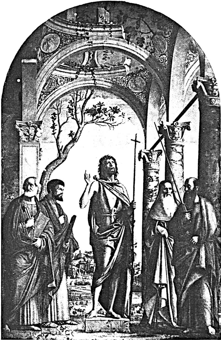
MADONNA DELL' ORTO—THE BAPTIST AND FOUR SAINTS