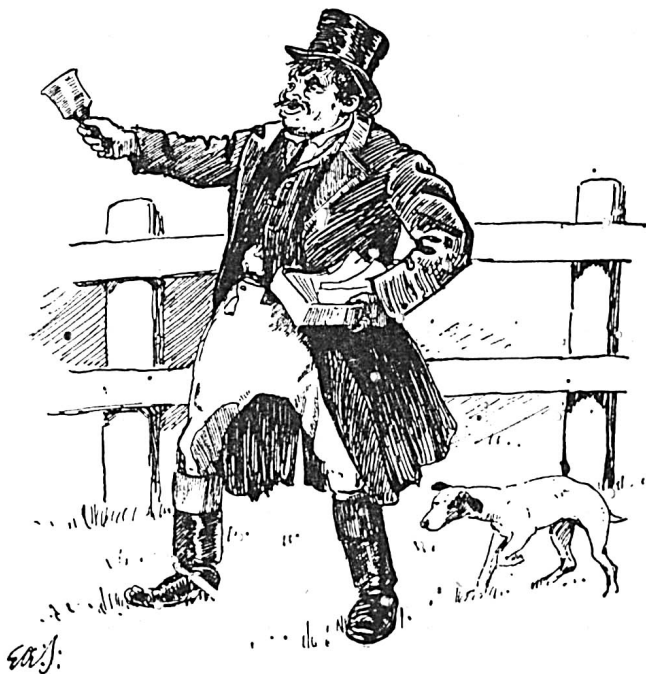
THE EGREGIOUS SLIPPER

and two vagrant fox-terriers were its sole adornment. A dark rim of spectators encircled it,