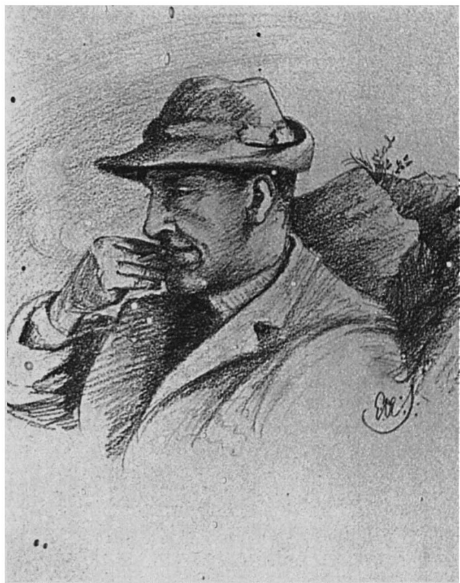
FLURRY AND I PUT IN A BLAZING SEPTEMBER DAY ON THE MOUNTAIN