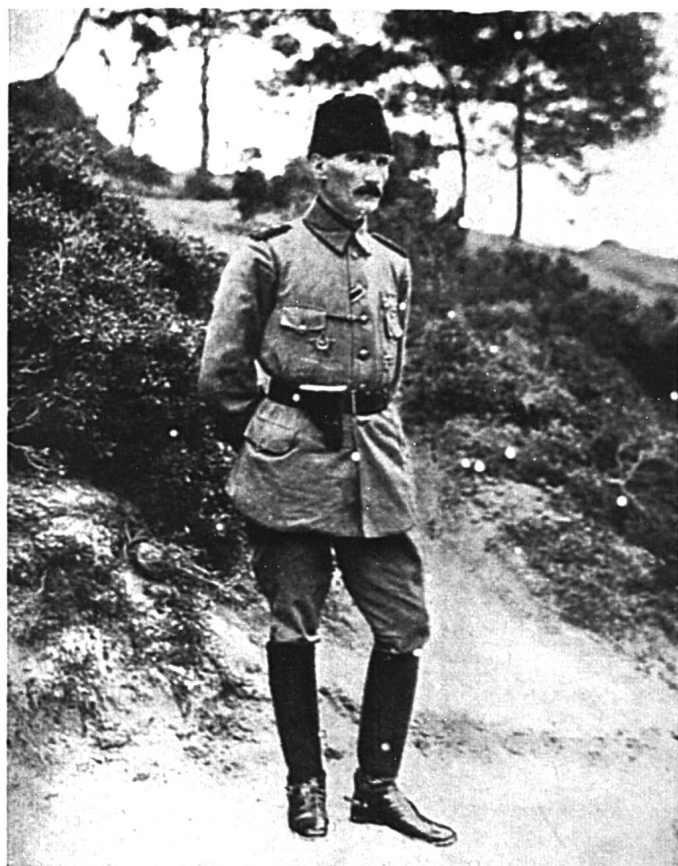
MUSTAFA KEMAL IN GALLIPOLI, 1915