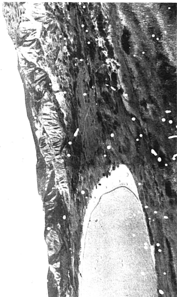
THE NORTHERN FLANK AT ANZAC