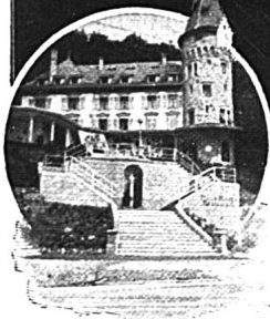
Electric Railway Brunnen-Morschach Axenfels-Axenstein

viron, a favourite resort of the summer-guests of Lucerne and the visitors of the Lake of the Four Cantons in general. Situated