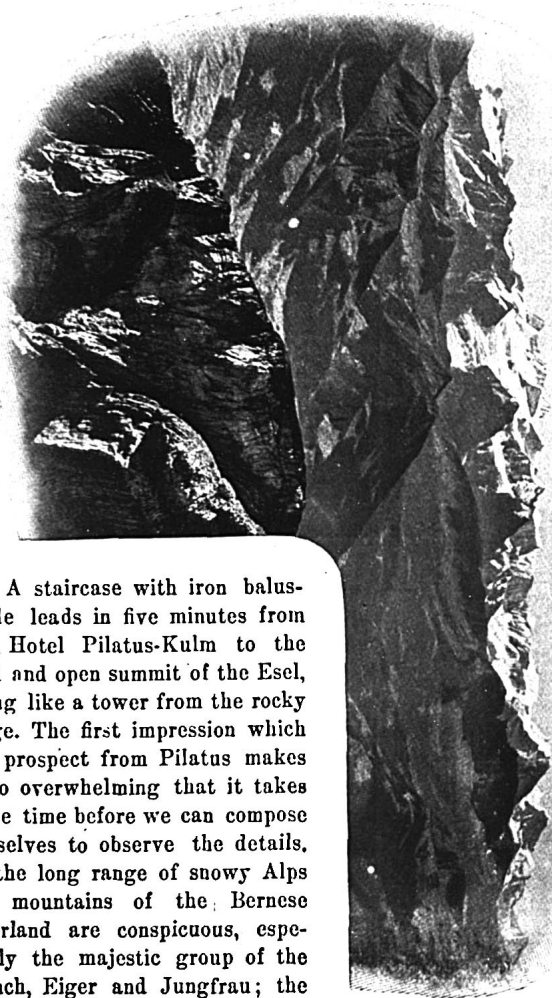
The Bernese Alps from Pilatus

A staircase with iron balustrade leads in five minutes from the Hotel Pilatus-Kulm to the bold and open summit of the Esel, rising like a tower from the rocky ridge. The first impression which the prospect from Pilatus makes is so overwhelming that it takes some time before we can compose ourselves to observe the details. In the long range of snowy Alps the mountains of the Bernese Oberland are conspicuous, especially the majestic group of the Mönch, Eiger and Jungfrau; the