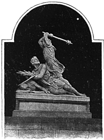
Winkelried Monument, Stans