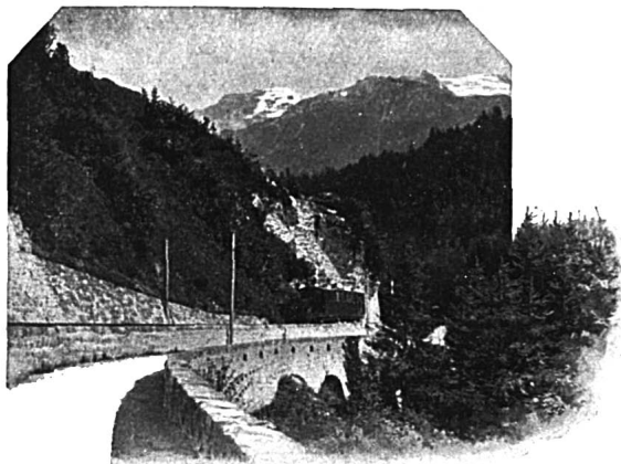
Electric Railway Stansstad-Engelberg

The next station on the road to Engelberg is the pretty village of Wolfenschlössen , a favourite summer resort on the mountain-side, above it a chapel stands near the place where Baumgarten killed the bailiff of Wolfenschlössen, as narrated in Schiller's drama. Somewhat higher up the valley, which gradually narrows, we come to Grafenort , consisting only of a chapel, an inn, and a house belonging to the convent of Engelberg. The scenery becomes more and more picturesque, and after passing through a beautiful wood we reach the heights, where a prospect opens of the Titlis, the Spannörter and the romantic valley, well watered and surrounded by snow-capped mountains, with the village of