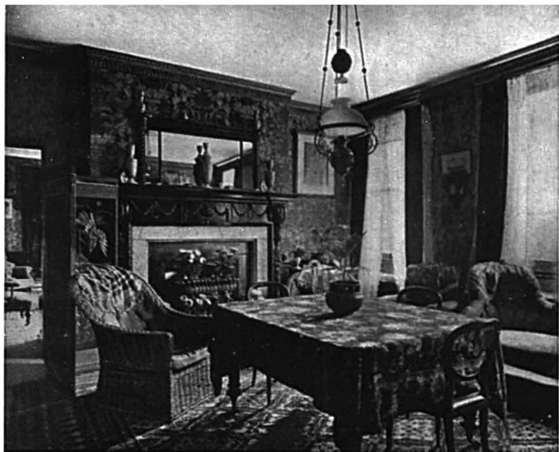
99 Rooms in College in the 'Seventies