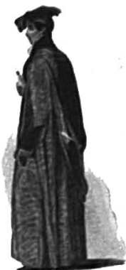
06 Student in Civil Law