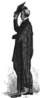
92 Pro proctor