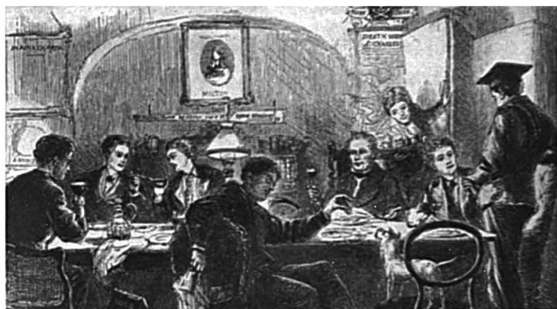
07 "A Wine"