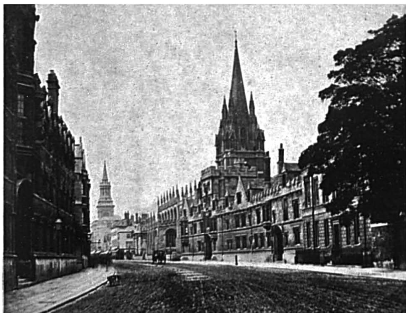
100 The High in the 'Seventies