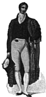
90 Gentleman Commoner