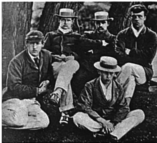
80 The Oxford Crew, 1860