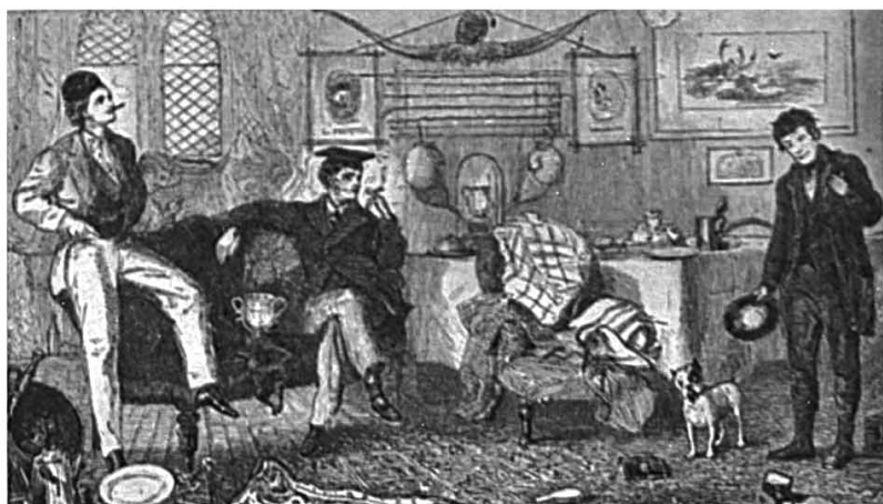
08 "After a Breakfast." Both from Tom Brown at Oxford