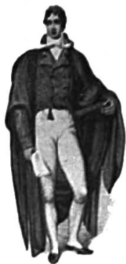
05 Bachelor of Arts