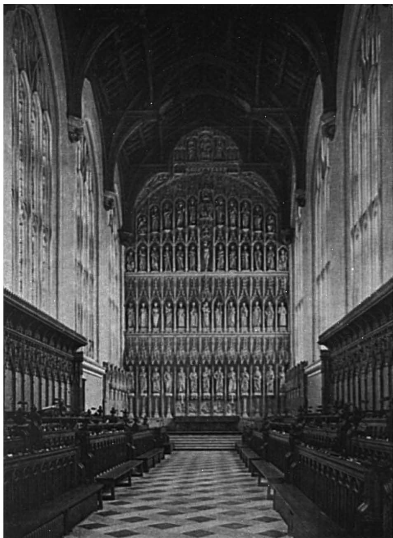
13 New College Chapel