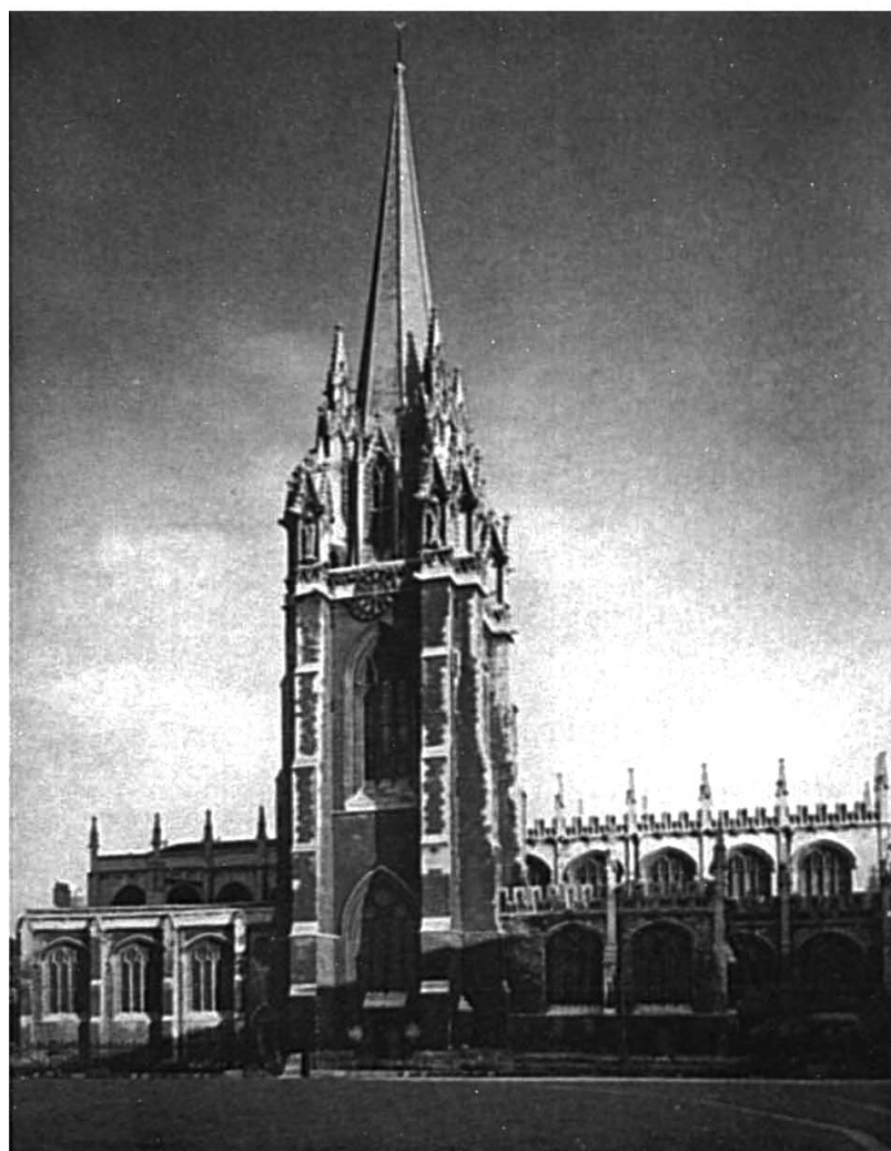
17 St. Mary's from the North