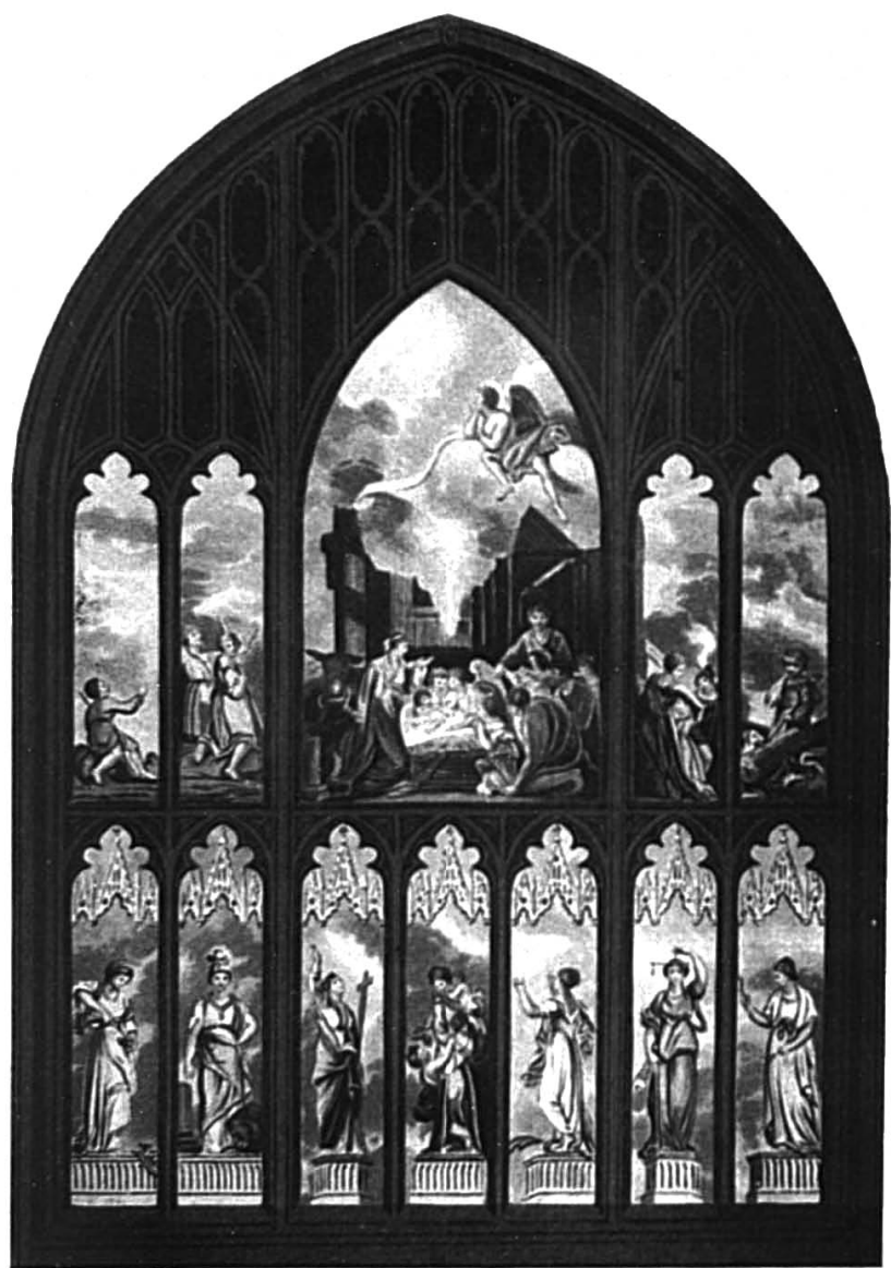
14 The Reynolds Window at New College ( Ackermann's "Oxford" )