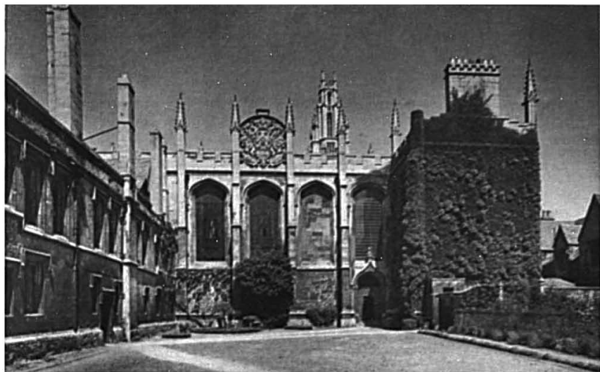
15 All Souls : the Hall Quad