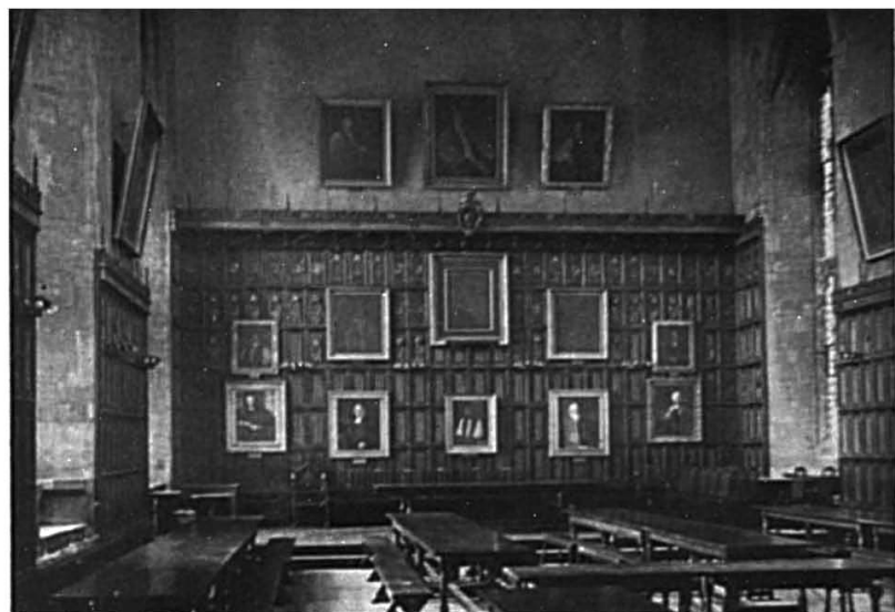
136 New College Hall