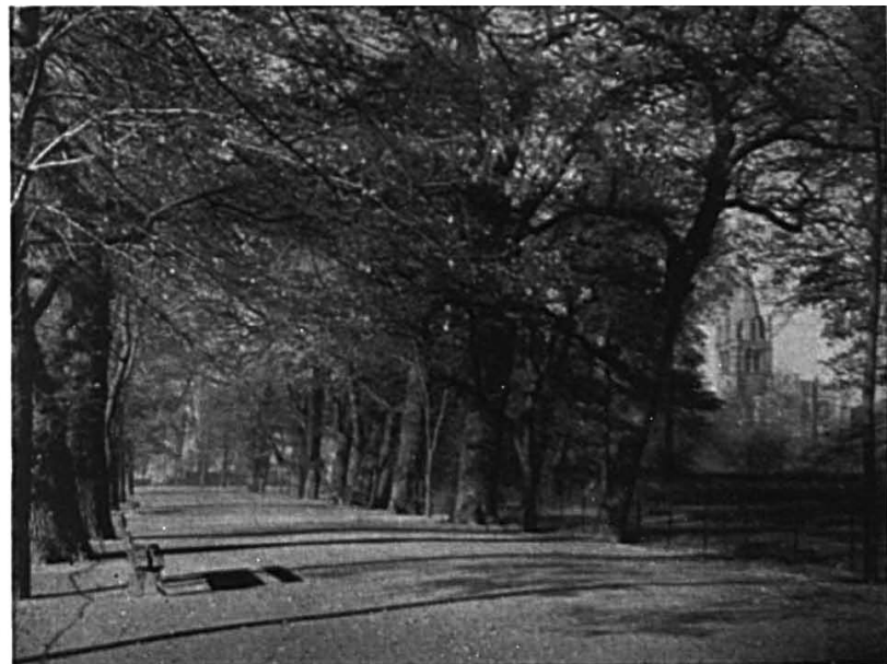
137 The Broad Walk in Christ Church Meadow