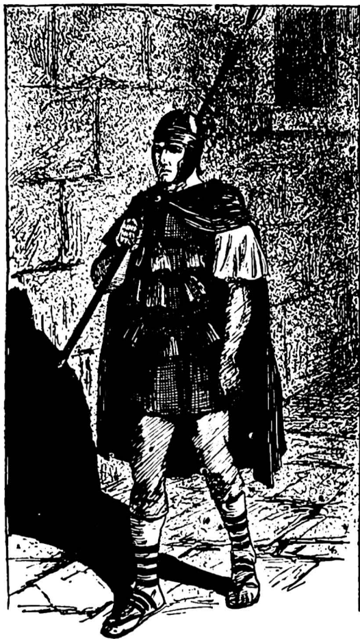
A NIGHT WATCHMAN OF ROME, SHOWING THE BELLS WORN ON HIS JACKET

He thought there was no other use of riches and money than to squander them away profusely; regarding all those as sordid wretches who kept their expenses within due bounds; and extolling those as truly noble and generous souls, who lavished away and wasted all before them. He never wore the same garment twice. He would game for four hundred thousand sesterces for every spot that came up upon the tali. He used to fish with a golden net, drawn by silken cords of the finest scarlet colour. It is said that he never travelled with less than a thousand carts attending him with his baggage: the mules being all shod with silver, and their drivers dressed in scarlet clothes of the finest wool; and a numerous train of footmen, and Africans, with bracelets on their arms, and mounted upon horses in splendid trappings.