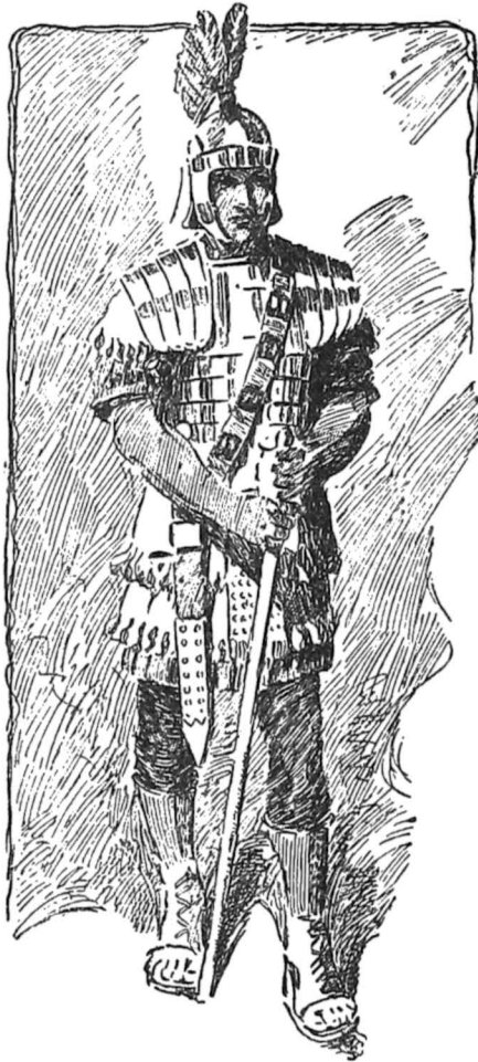
A CENTURION OFFICER

this intelligence the puny tyrant fainted; coming to himself he tore his robes and smote his head, with pusillanimous wailings. To the consolations of his nurse he replied, with the cries of an infant, "never was such ill-fortune as his; other Cæsars had fallen by the sword, he alone must lose the empire still living." At last he recollected himself sufficiently to summon troops from Illyricum for the defence of Italy; but these, it was found, were in correspondence with the enemy. Another resource, which served only to show to what straits he was driven, was to land sailors from the fleet at Ostia, and form them into a legion.