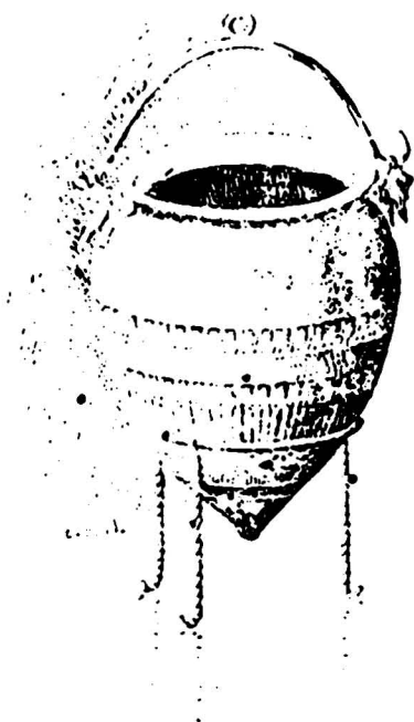
ROMAN BRONZE HELMET.

The Greeks on the other hand would regard, we may suppose, with more indulgence the caprices of their imperial visitor: they were accustomed to flatter, and in this instance there was some excuse for flattering a humour so flattering to themselves. The miserable vices he paraded before them were too like their own, at least in their period of corruption, to elicit strong moral reprobation. Nevertheless, if we may credit our accounts, he found more effectual means of disgusting them. The imperial tyranny was always pursued, as by its shadow, by profuse and fatal expenditure. It seemed unable to move without the attendance of a crowd of harpies, ever demanding their prey with maw insatiable. Every day required fresh plunder: every day proscriptions and confiscations revealed the prince's necessities, and if these for a moment slackened for want of victims, his hands were laid on the monuments of art, on every object on which money could be raised throughout the devoted land. The temples as well as the dwellings and the forums of Greece were ransacked again for the costliest and most cherished treasures, to be sold by auction to the highest bidder, or redeemed at exorbitant prices by their unhappy owners. Greece was powerless to resist, and her murmurs were drowned in the acclamations of the hired applauders; but she