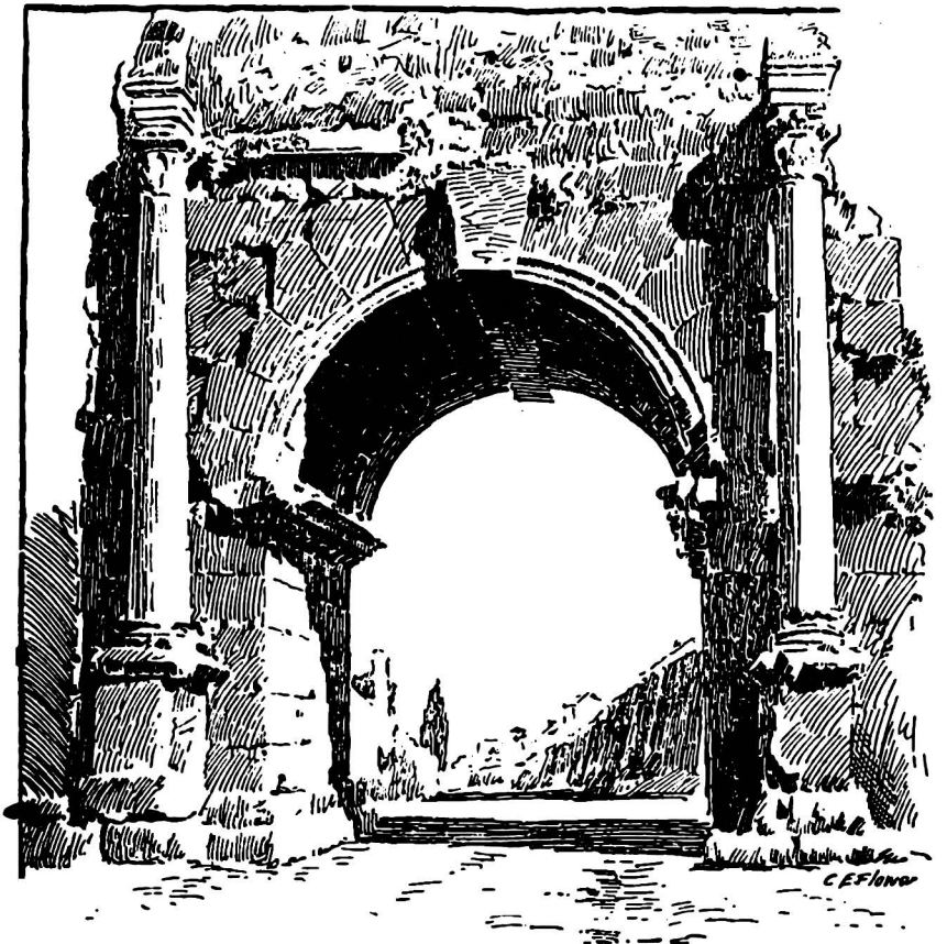
RUINS OF THE TRIUMPHAL ARCH OF DRUSUS

northern branch of the Tiber, about two miles from the ancient colony of Ostia. The Roman port insensibly swelled to the size of an episcopal city, where the corn of Africa was deposited in spacious granaries for the use of the capital. As soon as Alaric was in possession of that important place, he summoned the city to surrender at discretion; and his demands were enforced by the positive declaration that a refusal, or even a delay, should be instantly followed by the destruction of the magazines on