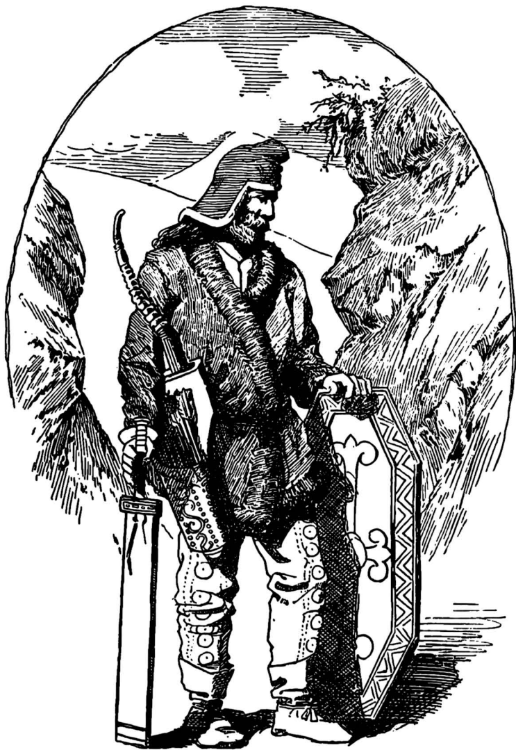
A GOTHIC WARRIOR (After Hothmoth)

The count of the domestics, adorned with the splendid ensigns of his dignity, had proceeded some way in the space between the two armies, when he was suddenly recalled by the alarm of battle. The hasty and imprudent attack was made by Bacurius the Iberian, who commanded a body of archers and targeteers; and as they advanced with rashness, they retreated with loss and disgrace. In the same moment the flying squadrons of Alatheus and Saphrax, whose return was anxiously expected by the general of the Goths, descended like a whirlwind from the hills, swept across the plain, and added new terrors to the tumultuous but irresistible charge of the barbarian host. The event of the battle of Hadrianopolis, so fatal to Valens and to the empire, may be described in a few words; the Roman cavalry fled; the infantry was abandoned, surrounded,