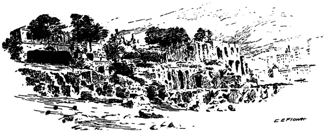
THE PALATINE, ROME

Arbogast could not hope that Theodosius would leave this murder unpunished. Not daring to proclaim himself emperor, he threw the purple robe on the shoulders of an imperial secretary, the rhetorician Eugenius. Theodosius, the avenger of orthodoxy, had the Catholic clergy on his side.