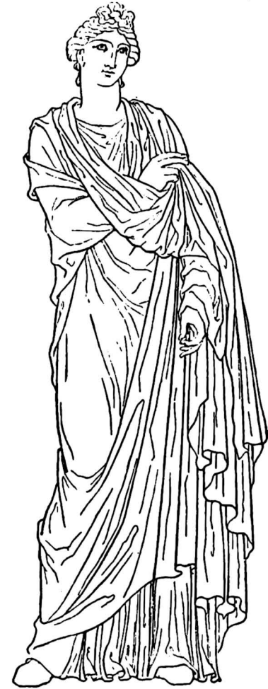
FAUSTINA, WIFE OF ANTONINUS PIUS

He was able, also, to succour towns which had been stricken by any plague, such as Rome, Antioch, Narbonne, and Rhodes, when devastated by fire or earthquake. The wealth of a prince, he used to say, is public felicity. He, himself, lived simply, accessible to all, and ready to render justice to all complaints. Two conspiracies against him were discovered; the two instigators alone perished. An Apology for Christianity , composed by Justin, the philosopher, and presented to the emperor, procured toleration and protection for the Christians, who were already numerous in Rome and the provinces.