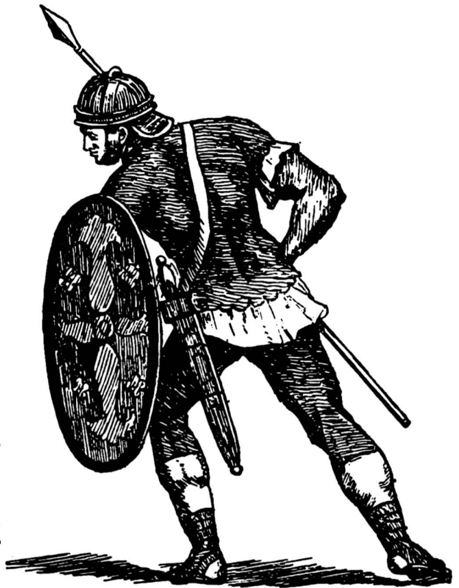
A SOLDIER (From Trajan's Column)

The column stood between the temple and forum of Trajan, at the end of the part now excavated, its base being considerably below the present ground level. It stood originally in a larger peristyle than at present, being surrounded by a court of about forty feet square, the intention being apparently that the figures should be viewed from the surrounding structures, just as the column itself was intended as a view-point for the buildings round the forum. The sculptures are progressively larger from the top, the perspective effect being obviously in the artist's mind. To-day the column stands in lonely grandeur in the forum of Trajan; the brilliant colours with which it was painted have long since disappeared under the stress of centuries of weather, but in other respects it is little altered from the original state, except at the very top, where, with striking incongruity, a poorly wrought statue of St. Peter now takes