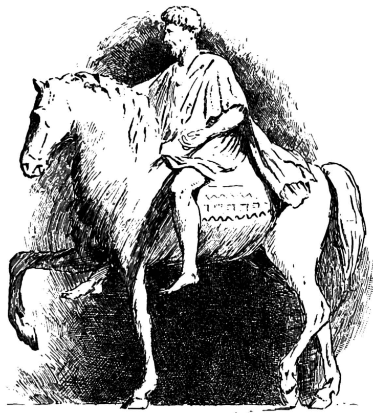
STATUE OF MARCUS AURELIUS IN THE CAPITOL

Notwithstanding this victory, the war continued for some months longer; but, after many violent conflicts, the barbarians sent to sue for peace. The emperor imposed conditions upon them, more or less severe, as he found them more or less disposed to revolt; being actually resolved to divide their territories into provinces, and subject them to the Roman Empire. However, a fresh rebellion called him to the defence of his dominions at home.