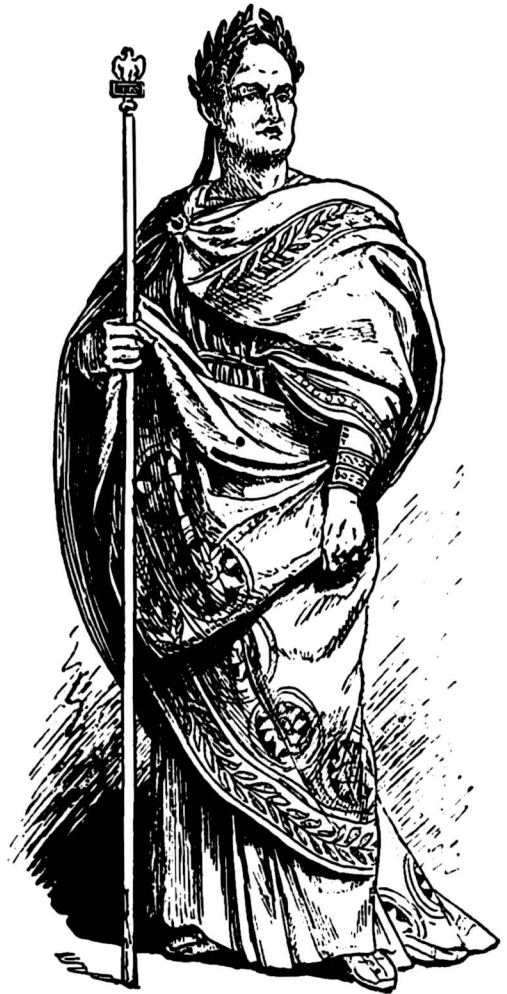
A ROMAN EMPEROR

The Jews also rebelled, both in Palestine and in the cities of Syria, Egypt, and other countries, because like the Christians they were incessantly harassed and persecuted. Trajan was forced to send troops against them, and at the same time renew the war against Assyria, Seleucia, Edessa and other rebellious countries and cities. He fell sick in consequence of the hardships of