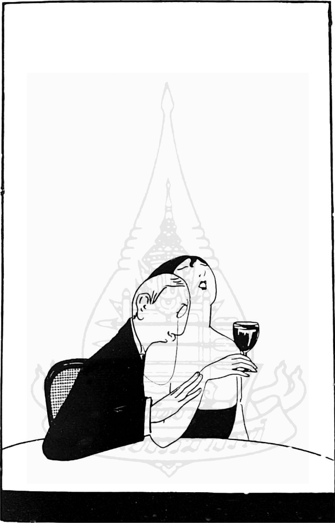
HE KISSES HER ON THE BARE SHOULDER