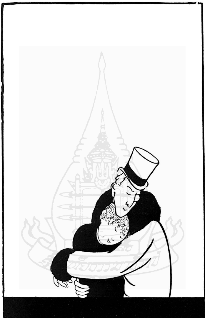
HE TAKES HER IN HIS ARMS