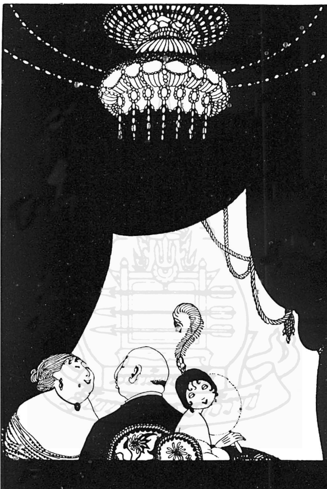
TIDE CURTAIN USES