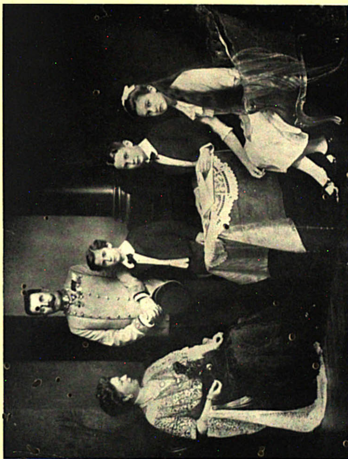
THE LATE ARCHDUKE FRANCIS FERDINAND AND HIS FAMILY

Taken two days prior to his assassination in Sarajevo, July, 1914