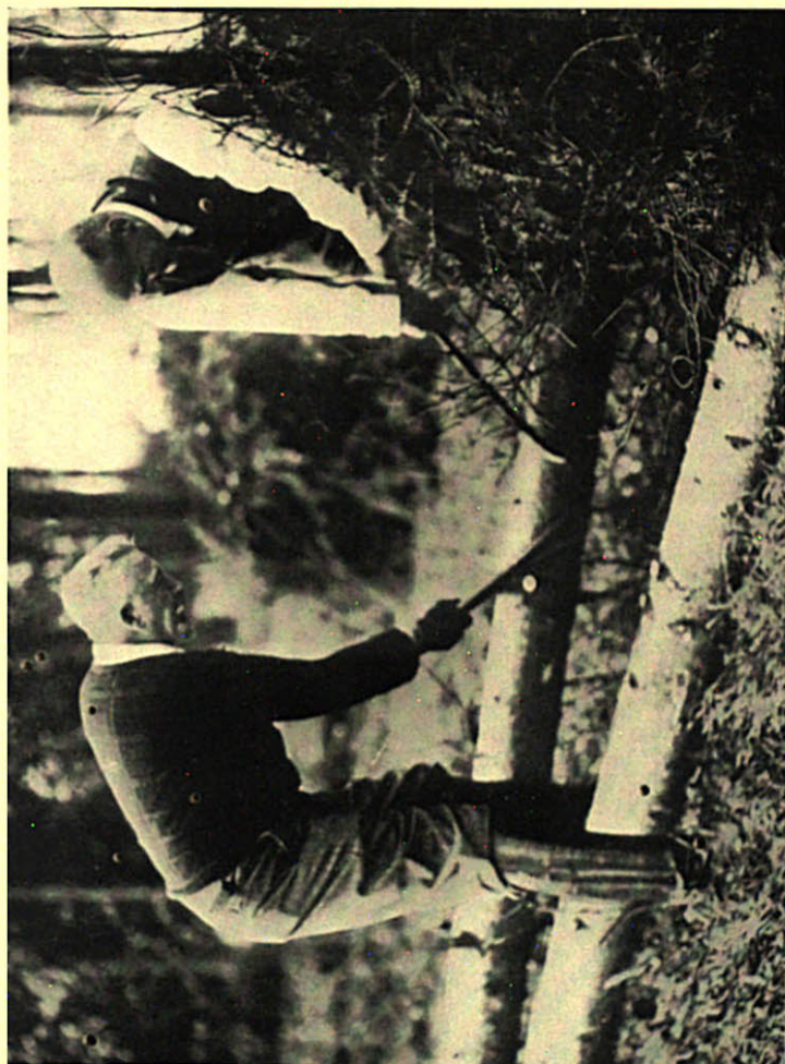
THE EX-KAISER TREE-CUTTING UPON HIS ESTATE AT DOORN