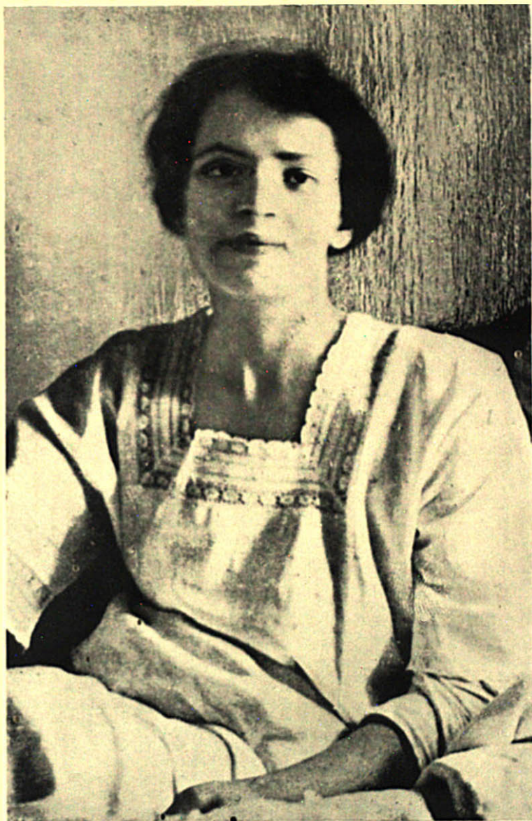
A PHOTO TAKEN IN MOMMSEN SANATORIUM OF H.R.H. PRINCESS ANASTASIA After Ekaterinburg