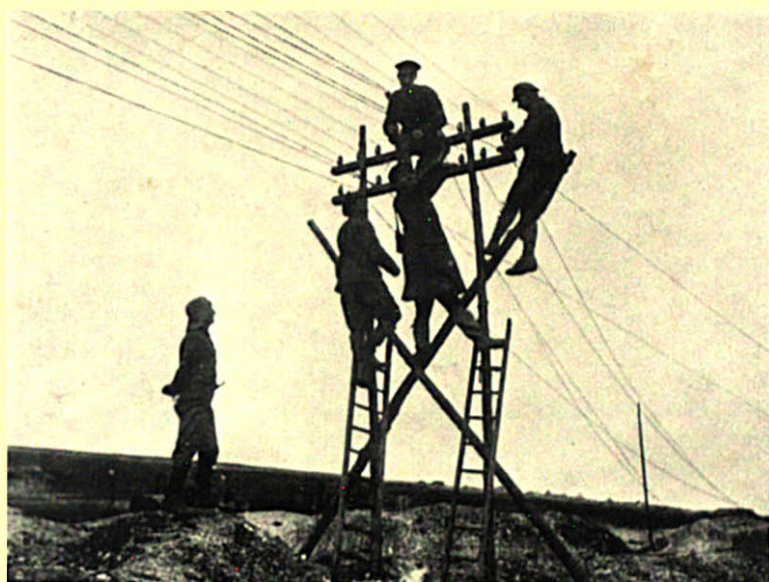
WIRE REPAIRING—AFTER THE BATTLE