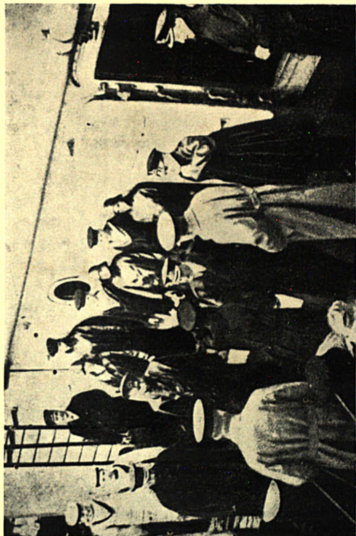
LORD KITCHENER (IN GREY COAT ON RIGHT) ON BOARD THE "IRON DUKE" JUST PRIOR TO EMBARKING ON THE "HAMPSHIRE"