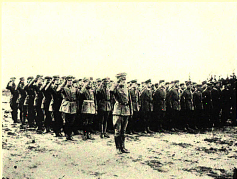
LAST PHOTO EVER TAKEN OF "THE RED KNIGHT OF GERMANY"