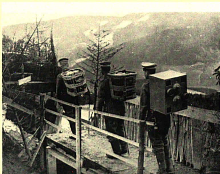
GERMAN INTELLIGENCE MEN TRANSPORTING WIRELESS AND PIGEONS