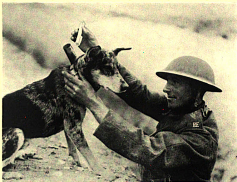
CAPTURE OF A GERMAN WAR DOG