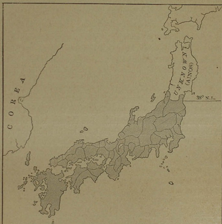
Japan, as known to the Ancient Mikados before the Fifth Century.

fight in ambush from behind trees, rocks, or in the rank undergrowth, using every artifice by which, as pursued, they could inflict the greatest damage upon an enemy with the least loss and danger to themselves. In the lore of the forest they were so well read that they felt at home in the most tangled wilds. They were able to take advantage of every sound and sign. They were accustomed to disguise themselves in bear-skins, and thus act as spies and scouts. Fire was one of their chief means of attack. On a certain occasion they kin-