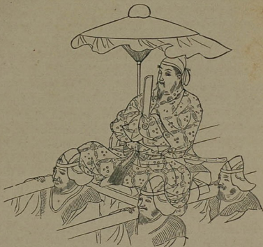
The Mikado's Method of Travel in very Ancient Times.

evation, could not be distinguished from the residences of the nobles, or from a temple. All this was in keeping with the sacredness of the personage enshrined within. For vain mortals, sprung from inferior or wicked gods, for upstart generals, or low traders bloated with wealth, luxury and display were quite seemly. Divinity needed no material show. The circumstances and attributes of deity were enough. The indulgence in gaudy display was opposed to the attributes and character of the living representative of the Heavenly Line. This rigid simplicity was carried out even after death. In striking contrast with the royal burial customs of the nations of Asia are those of Japan.