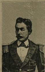
Japanese Naval Officer.

During the summer, Mr. Katsū Awa was made Minister of the Navy, and Mr. Ōkubo Ichio, Mayor of Tōkiō. A large number of ex-