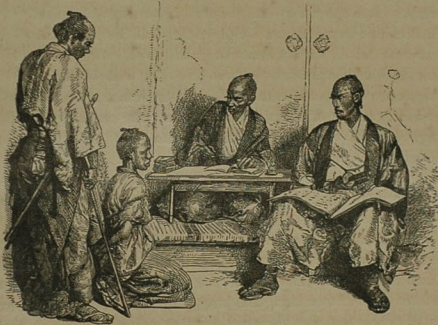
Court Scene. Old Style.

Since the Restoration, revised statutes and regulations have greatly decreased the list of capital punishments, reformed the condition of prisons, and made legal processes less cruelly simple, but with elaboration of mercy and justice. The use of torture to obtain testimony is now entirely abolished. Law schools have also been established, lawyers are allowed to plead, thus giving the accused the assistance of counsel for his defense. The cut represents the old style of trial.