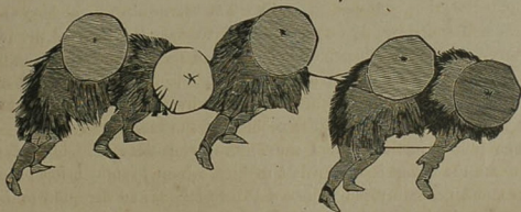
On the Tow-path. (Hokusai.)

THE next day was a Sabbath in a Sabbathless land. I awoke to find a perfect day—a heaven of cloudless blue, and every thing quiet and still. How should I spend Sunday here? There were no church-bells pealing, no church, no pews, no pulpit, no street-cars, no pavement, no Sunday-school, no familiar friends. I walked to the gate of the court-yard and looked out upon the street. Business and traffic were going on as usual. The samurai on clogs, in his silk and crested coat, with swords in girdle and cue on clean-shorn crown, was walking on, in his dignity, as the lord of society. The priest, in his flowing crape and brocade collar, with shaven head, and rosary on