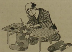
Pattern Designer preparing a Roll of Silk for the Dye-vat.

the plane toward him. I notice a blacksmith at work: he pulls the bellows with his foot, while he is holding and hammering with both hands. He has several irons in the fire, and keeps his dinner-pot boiling with the waste flame. His whole family, like the generations before him, seem to "all get their living in the hardware line." The cooper holds his tub with his toes.