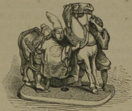
Nétsuké, or Ivory Button, for holding a Gentleman's Pipe and Pouch in his Girdle.

thrust up through the girdle. The one represented in the accompanying cut shows how a Japanese rider, evidently somebody, from his hempen toque, mounts a horse, i. e. , on the right (or wrong) side, while his bettō holds the steed.