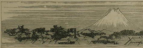
View of Fuji, from Suruga Dai, in Tokiō.

Among the many sites in the city from which one can get a view of Fuji from base to summit, arè Atago yama, the top of Kudan zaka, and Suruga Dai, or elevation, so named from the fact that you behold the lordly mountain as though you were in Suruga itself.