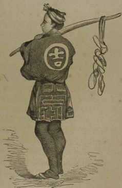
Coolie waiting for a Job.