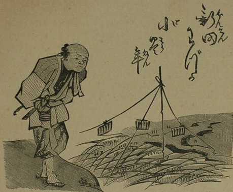
A Japanese Farmer. (Seed-beds of rice protected from the birds by strings and slips of wood.)*

overmeddlesome officialdom touches his land to transfer, sell, or redivide it: then he rises as a rebel. In time of war, he is a disinterested and a passive spectator, and he does not fight. He changes masters with apparent unconcern. Amidst all the ferment of ideas induced by the contact of Western civilization with Asiatic within the last two decades, the farmer stolidly remains conservative: he knows not, nor cares to hear, of it, and hates it because of the heavier taxes it imposes upon him.