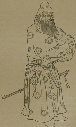
A Court Noble in Ancient Japan. (From a Native Drawing.)

The annexed illustration is taken from a native work, and represents a chief or nobleman in ancient Japan. It will be noticed that beards and mustaches were worn in those days. The artist has depicted his subject with a well-wrinkled face to make him appear venerable, and with protruding cheeks to show his lusty physique, recalling the ideals of Chinese art, in which the men are always portly and massive, while the women are invariably frail and slender. His pose, expression, folded arms, and dress of figured material (consisting of one long loose robe with flowing sleeves, and a second garment, like very wide trousers, girded at the waist with straps of the same material) are all to be seen, though in modified forms, in modern Japan. The fashion of twenty centuries have changed but slightly. Suspended from his girdle may be seen the magatama chatelaine, evidently symbolizing his rank. The magatama are perforated and polished pieces of soap-stone or cornelian, of various colors, shaped something like a curved seed-pod. They were strung