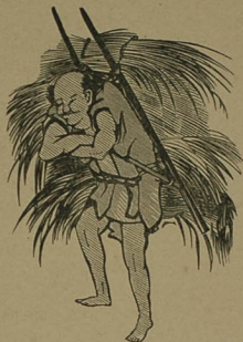
The Peasant of To-day. (Carrying Home the Sheaves of Rice.) Hokusai.

As yet there was no writing. All communications were oral, all teachings handed down from father to son. Memory was the only treasury of thought. There is, indeed, shown in Japan at the present day a so-called ancient Japanese alphabet—the kami , or god, letters—which it is asserted the ancient Japanese used. This assertion is voided of truth by the testimony of the best native scholars to the contrary. No books or ancient inscriptions exist in this character. I